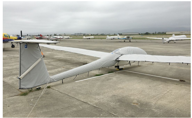
DG-505 Canopy/Nose, Wing, Empennage & Horiz. Stab. Covers DG-505 Canopy/Nose, Wing, Empennage & Horiz. Stab. Covers