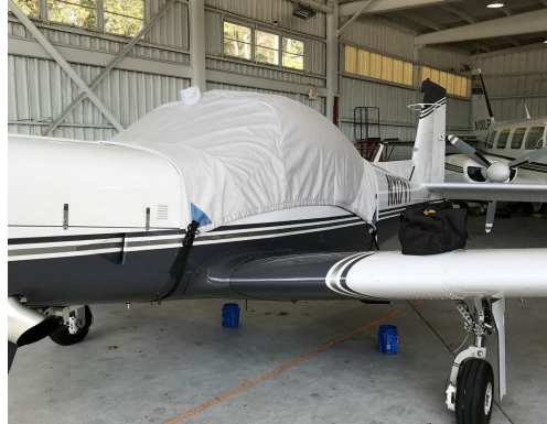
Valmet L-90 Canopy Cover

This cover type is made from Silver Acrylic Sunbrella canvas and is 100% lined with a soft and smooth microfiber. Bruce's Custom Covers developed this material combination especially for aircraft protection. The outer material is medium weight and treated for water resistance, UV resistance and anti-static buildup. The inner lining is a very soft and smooth microfiber to prevent scratching. The material is very reflective, and tests show that the cabin interior temperature can be reduced to near-ambient temperature on the hottest of days. It is water, ice and snow repellent, yet breathable to allow moisture to escape from between the cover and the aircraft surface.