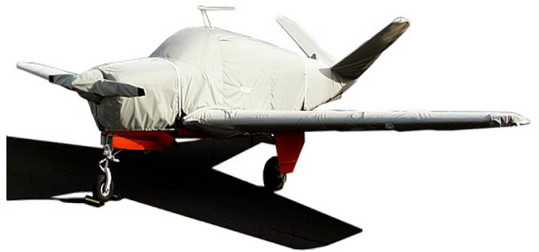
Beech Bonanza Full Cover Set