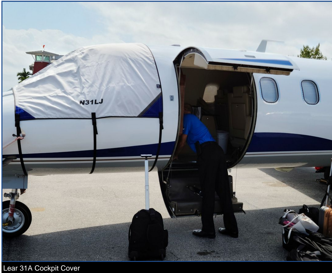
Lear 31A Cockpit Cover