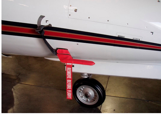
Learjet Heat Resistant Pitot Cover with AOA strap

Lear 85 Heat Resistant Pitot Tube Covers , are made of Naugahyde vinyl, and lined with a non-burning material. They are designed to cover the entire pitot assembly, slipping over the tube and tightening around the base with a Velcro strap detail. A "Remove Before Flight" streamer is attached to the cover. Heat Resistant Pitot Covers are an upgrade to our standard design, and help prevent the pitot cover from melting onto the tube if the pitot heat is accidentally turned on while installed. If you want the set tethered together, please let us know.