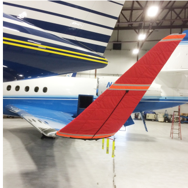
Falcon 2000 Winglet Pad