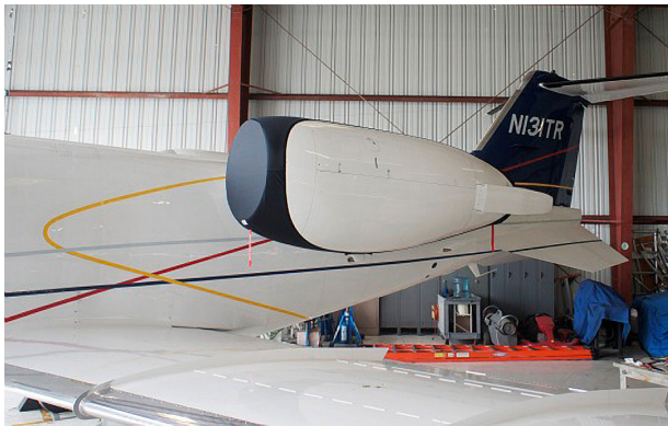
Lear 60 Engine Covers, "Bikini style"

The Lear 85 Bikini Style Engine Covers are a single-piece design using a soft and smooth stretchy and fabric. The cover stretches tightly over both the intake and exhaust, installing quickly and easily. These covers are designed to be used as hangar dust covers and have a useful life of approximately one year.