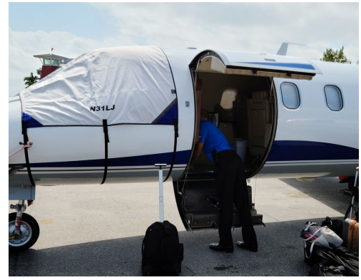
Lear 31A Cockpit Cover