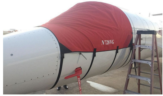
Learjet 45 Cockpit Cover