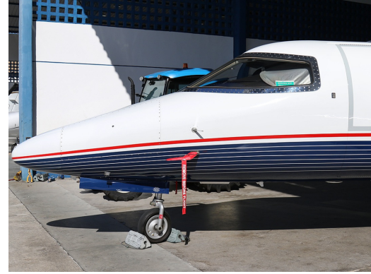
Lear Pitot Cover