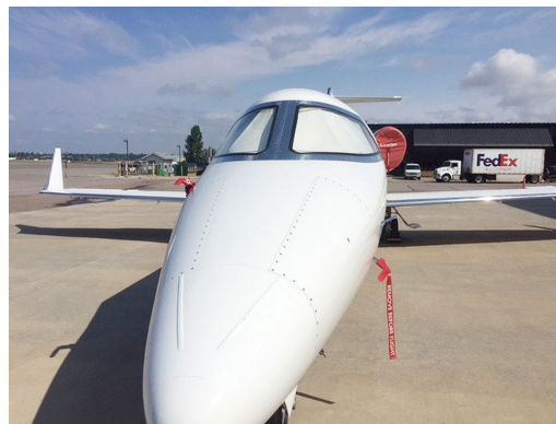
Lear Models 40 &amp; 45 Cockpit Heatshields, Covers All Cockpit Windows

Cockpit Heatshields are interior sunshades for the aircraft's cockpit. The product is a unique composite of closed-cell foam with a silver mylar finish. The semi-rigid design is stiff enough to stand inside the window framing. The set folds up flat and is easily stored in the included storage sleeve. Some designs may require velcro and suction cups. Our Heatshields for jets are offered white side out because some aircraft manufacturers have issued advisories against reflective window inserts due to potential heat damage. A Heatshield is an excellent short-term remedy for cockpit overheating, but an external fabric cover is more effective for long-term protection.