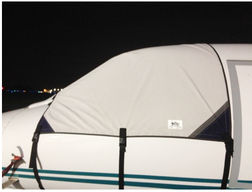
Lear 31 Cockpit Cover