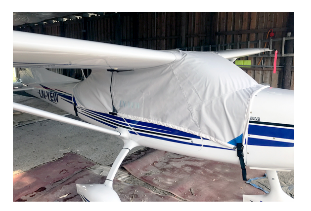
TL Ultralight Sirius TL-3000 Canopy Cover (Over-The-Top Style) TL Ultralight Sirius TL-3000 Canopy Cover (Over-The-Top Style)