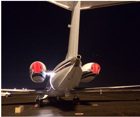
Embraer Legacy Exhaust Plugs

The Engine Inlet Plugs are custom fit for your Embraer Legacy 500 Praetor, (EMB-545/550) intakes, made with heavy-duty vinyl material, and stuffed with a single block of sculpted urethane foam. Each plug has a zipper that allows the foam to be removed and dried if necessary. Engine plugs have 'remove before flight' streamers sewn onto the face of the plugs. Most plugs are imprinted with the aircraft registration number in black for an extra charge. Storage bag NOT included. Engine plugs may be inserted after flight when the engine is still warm. Engine Inlet Plugs are commonly referred to as Cowl Plugs, Intake Plugs, Cowl Blocks, Engine Blocks, and Engine Bungs.