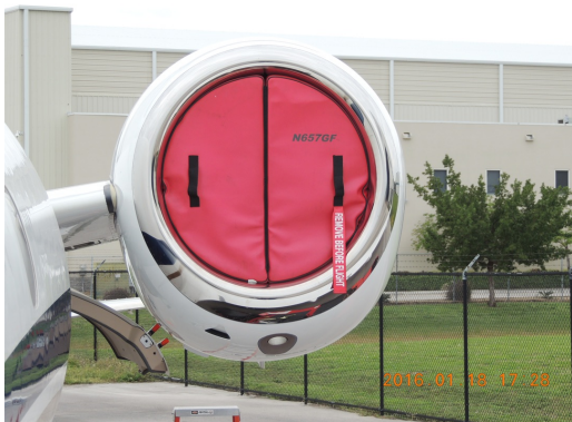
Embraer Legacy 500 Engine Inlet Plug, folding type

The Engine Inlet Plugs are custom fit for your Embraer Legacy 500 Praetor, (EMB-545/550) intakes, made with heavy-duty vinyl material, and stuffed with a single block of sculpted urethane foam. Each plug has a zipper that allows the foam to be removed and dried if necessary. Engine plugs have 'remove before flight' streamers sewn onto the face of the plugs. Most plugs are imprinted with the aircraft registration number in black for an extra charge. Storage bag NOT included. Engine plugs may be inserted after flight when the engine is still warm. Engine Inlet Plugs are commonly referred to as Cowl Plugs, Intake Plugs, Cowl Blocks, Engine Blocks, and Engine Bungs.