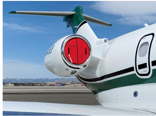
Embraer S A EMB-545 Engine Inlet & Exhaust Plug Set (folding type)