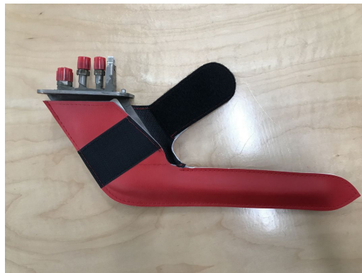
Lear 55 Pitot Cover