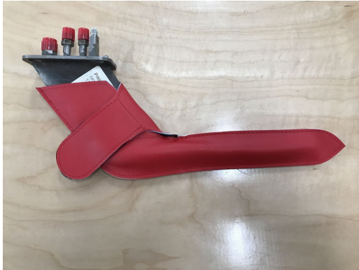
Lear 55 Pitot Cover

The Engine Inlet Plugs are custom fit for your Lear 55 intakes, made with heavy-duty vinyl material, and stuffed with a single block of sculpted urethane foam. Each plug has a zipper that allows the foam to be removed and dried if necessary. Engine plugs have 'remove before flight' streamers sewn onto the face of the plugs. Most plugs are imprinted with the aircraft registration number in black for an extra charge. Storage bag NOT included. Engine plugs may be inserted after flight when the engine is still warm. Engine Inlet Plugs are commonly referred to as Cowl Plugs, Intake Plugs, Cowl Blocks, Engine Blocks, and Engine Bungs.