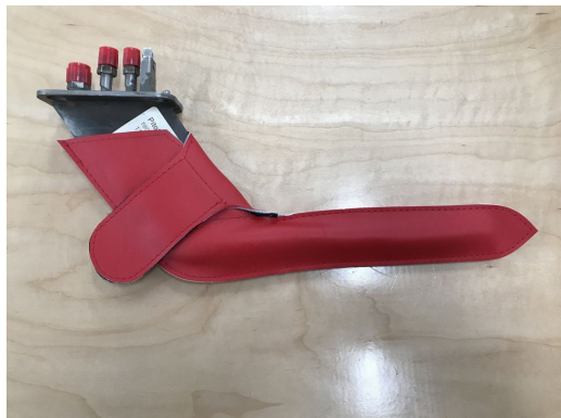
Lear 55 Pitot Cover

The Engine Inlet Plugs are custom fit for your Lear 55 intakes, made with heavy-duty vinyl material, and stuffed with a single block of sculpted urethane foam. Each plug has a zipper that allows the foam to be removed and dried if necessary. Engine plugs have 'remove before flight' streamers sewn onto the face of the plugs. Most plugs are imprinted with the aircraft registration number in black for an extra charge. Storage bag NOT included. Engine plugs may be inserted after flight when the engine is still warm. Engine Inlet Plugs are commonly referred to as Cowl Plugs, Intake Plugs, Cowl Blocks, Engine Blocks, and Engine Bungs.