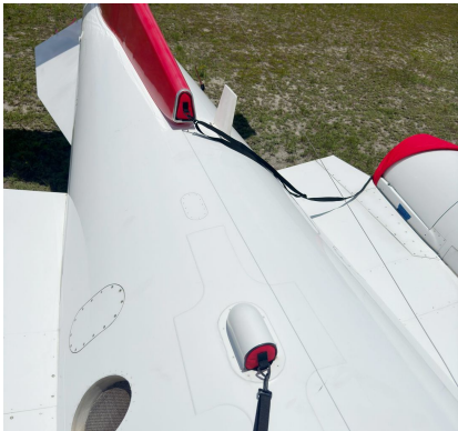
Lear 45 Dorsal, ACM & Fuel Vent Inlet Plugs