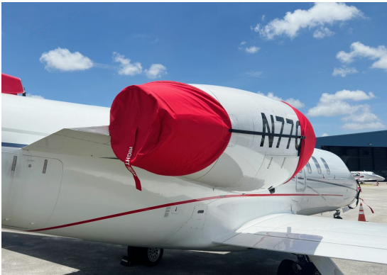
Lear 45 Engine Covers