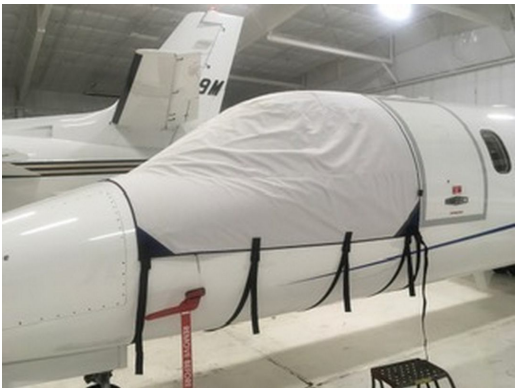
Lear 45 Cockpit Cover