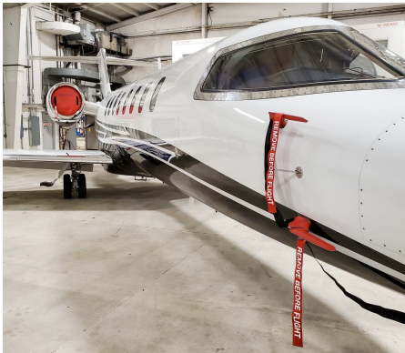
Lear 45 Intake/Exhaust Plug Set

The Engine Inlet Plugs are custom fit for your Lear Models 40 & 45 intakes, made with heavy-duty vinyl material, and stuffed with a single block of sculpted urethane foam. Each plug has a zipper that allows the foam to be removed and dried if necessary. Engine plugs have 'remove before flight' streamers sewn onto the face of the plugs. Most plugs are imprinted with the aircraft registration number in black for an extra charge. Storage bag NOT included. Engine plugs may be inserted after flight when the engine is still warm. Engine Inlet Plugs are commonly referred to as Cowl Plugs, Intake Plugs, Cowl Blocks, Engine Blocks, and Engine Bungs.