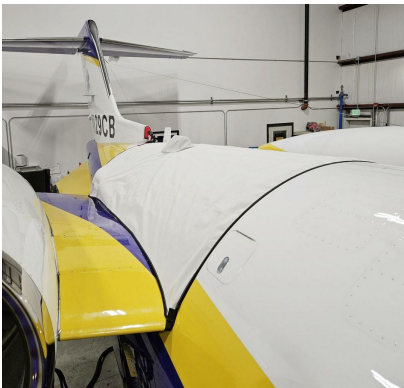
Lear 45 Empennage Saddle Cover W/ Dorsal Inlet Plug (Covers Upper Fuselage Between Pylons, Acm/Apu Area)