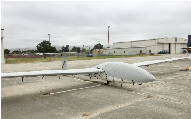
DG-505 Canopy/Nose, Wing, Empennage & Horiz. Stab. Covers