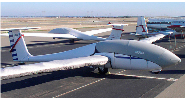
Grob 103 Canopy/Nose Cover and Wing Covers