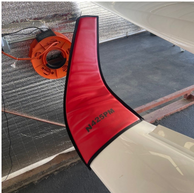
Stemme S-10 & S-12 Wingtip Pads