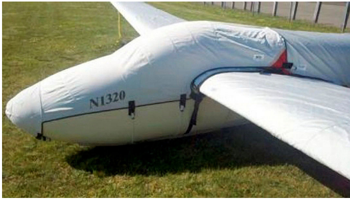
Schweizer SGS 1-26B Canopy/Nose, Wings & Empennage Covers