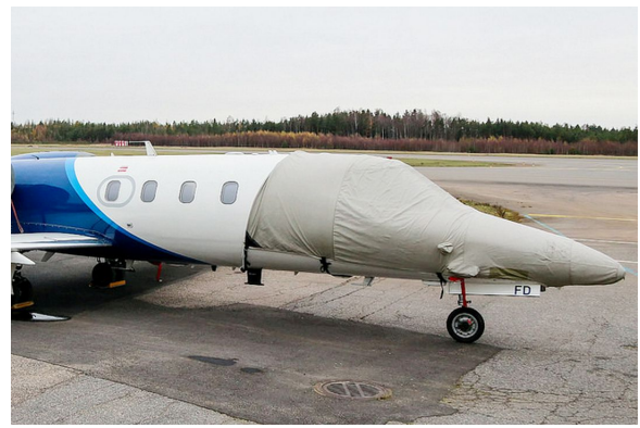
Learjet Cockpit/Nose Cover