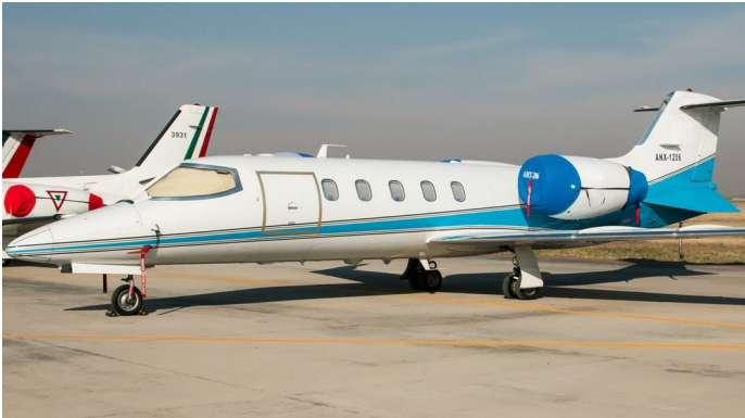
Lear 35 Engine & Pitot Covers

Cockpit Heatshields are interior sunshades for the aircraft's cockpit. The product is a unique composite of closed-cell foam with a silver mylar finish. The semi-rigid design is stiff enough to stand inside the window framing. The set folds up flat and is easily stored in the included storage sleeve. Some designs may require velcro and suction cups. Our Heatshields for jets are offered white side out because some aircraft manufacturers have issued advisories against reflective window inserts due to potential heat damage. A Heatshield is an excellent short-term remedy for cockpit overheating, but an external fabric cover is more effective for long-term protection.