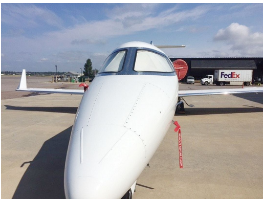
Lear Models 40 & 45 Cockpit Heatshields, Covers All Cockpit Windows