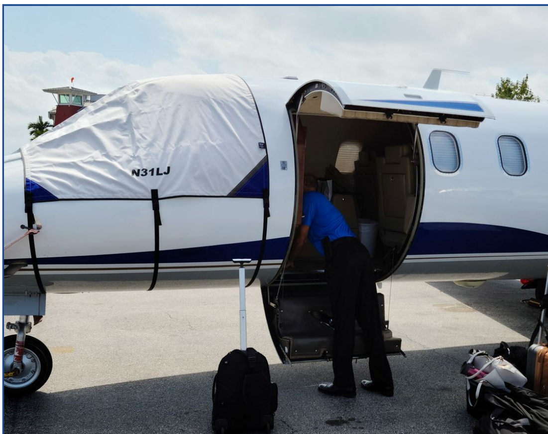
Lear 31A Cockpit Cover