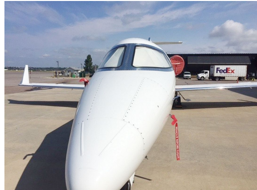
Lear Models 40 & 45 Cockpit Heatshields, Covers All Cockpit Windows