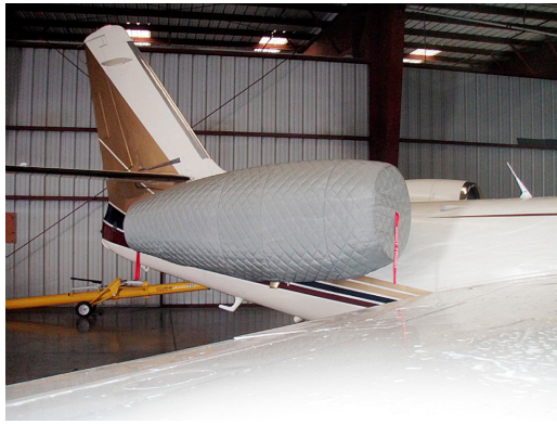
IAI Westwind Insulated Engine Nacelle Cover