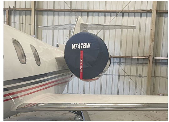
Lear 35A Engine Covers