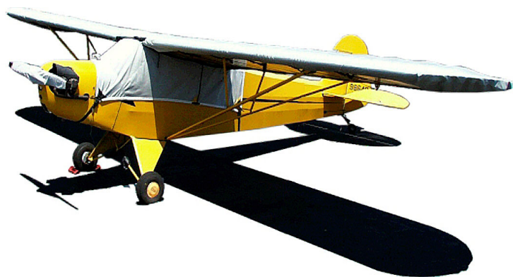
Piper J3 Canopy, Wing and Prop Covers