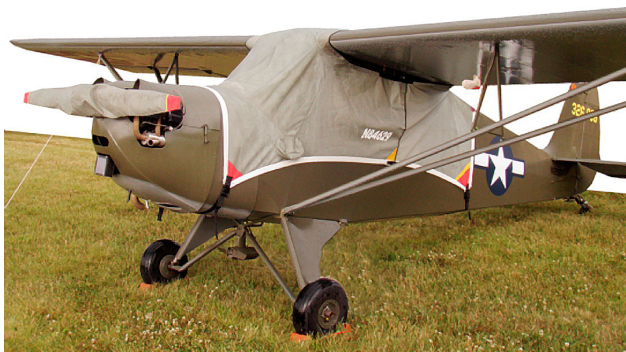
L3 Canopy Cover & Prop Cover