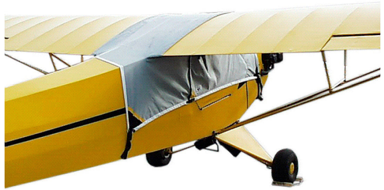
Piper J3 Over-Top Canopy Cover