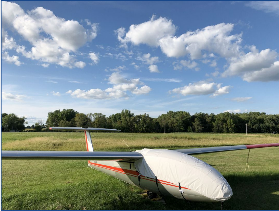
L-23 Super Blanik Canopy/Nose Cover