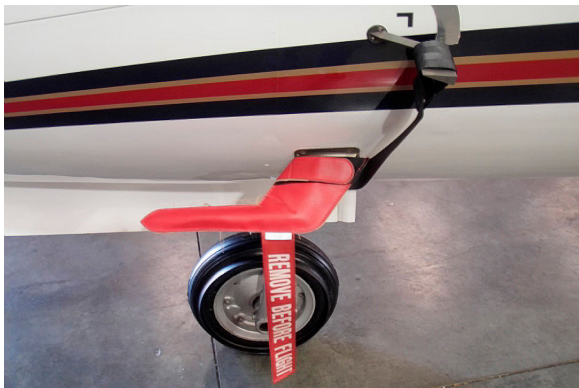
Learjet Heat Resistant Pitot Cover and AOA Strap

The Engine Inlet Plugs are custom fit for your Lear 24 & 25 intakes, made with heavy-duty vinyl material, and stuffed with a single block of sculpted urethane foam. Each plug has a zipper that allows the foam to be removed and dried if necessary. Engine plugs have 'remove before flight' streamers sewn onto the face of the plugs. Most plugs are imprinted with the aircraft registration number in black for an extra charge. Storage bag NOT included. Engine plugs may be inserted after flight when the engine is still warm. Engine Inlet Plugs are commonly referred to as Cowl Plugs, Intake Plugs, Cowl Blocks, Engine Blocks, and Engine Bungs.