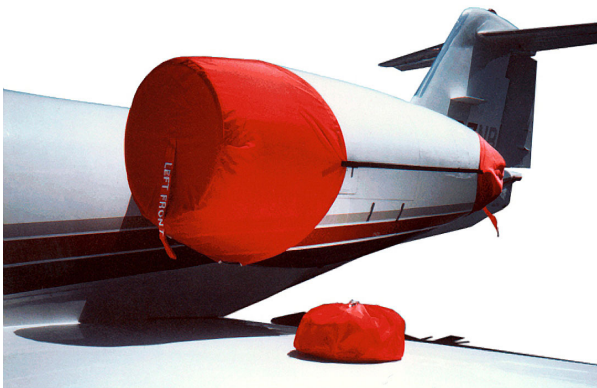
Lear 35 Engine Covers

The Lear 24 & 25 Bikini Style Engine Covers are a single-piece design using a soft and smooth stretchy and fabric. The cover stretches tightly over both the intake and exhaust, installing quickly and easily. These covers are designed to be used as hangar dust covers and have a useful life of approximately one year.