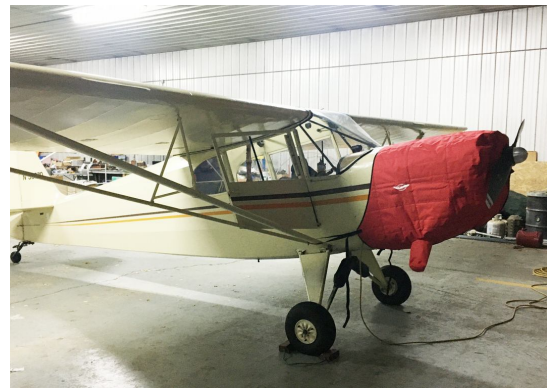
Taylorcraft DC-65 Insulated Engine Cover