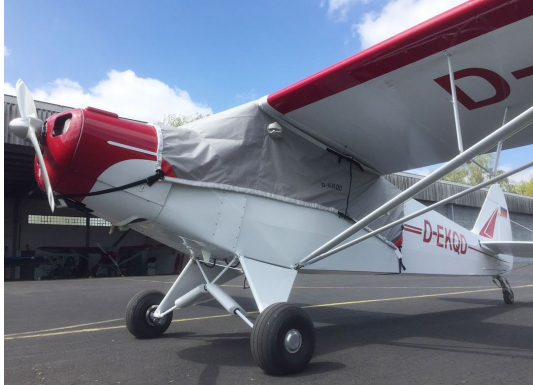
Piper Super Cub Travel Weight Canopy Cover

This cover type is made from Silver Acrylic Sunbrella canvas and is 100% lined with a soft and smooth microfiber. Bruce's Custom Covers developed this material combination especially for aircraft protection. The outer material is medium weight and treated for water resistance, UV resistance and anti-static buildup. The inner lining is a very soft and smooth microfiber to prevent scratching. The material is very reflective, and tests show that the cabin interior temperature can be reduced to near-ambient temperature on the hottest of days. It is water, ice and snow repellent, yet breathable to allow moisture to escape from between the cover and the aircraft surface.