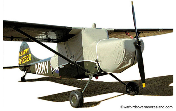
Cessna L-19 Canopy & Engine Covers