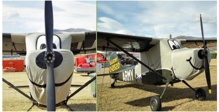
Cessna L-19 Bird Dog Canopy Cover, Engine Cover