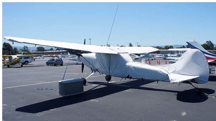
Cessna L-19 Extended Over-the-top Canopy, Engine, Empennage & Wing Covers

WINTER USE MATERIAL - Made with Solution-Dyed Polyester fabric, this option is intended for seasonal use to aid in deicing, rain mitigation, or for occasional travel. The material is lighter and more compact, but more susceptible to UV damage and may have a shorter useful life if used continuously outside than the all-year use material.