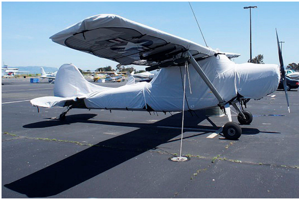
Wing Covers on Cessna Bird Dog