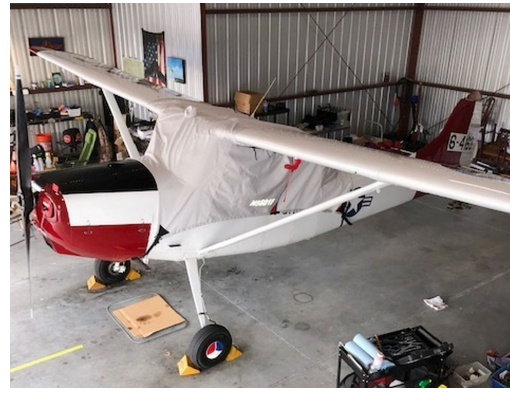
Cessna Bird Dog, L-19, O-1, 305 Canopy Cover, Over-Top Type