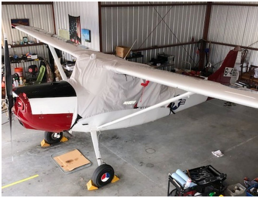
Cessna Bird Dog, L-19, O-1, 305 Canopy Cover, Over-Top Type