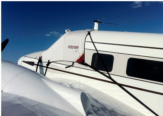
Beech 18 Cockpit Cover

This cover type is made from Silver Acrylic Sunbrella canvas and is 100% lined with a soft and smooth microfiber. Bruce's Custom Covers developed this material combination especially for aircraft protection. The outer material is medium weight and treated for water resistance, UV resistance and anti-static buildup. The inner lining is a very soft and smooth microfiber to prevent scratching. The material is very reflective, and tests show that the cabin interior temperature can be reduced to near-ambient temperature on the hottest of days. It is water, ice and snow repellent, yet breathable to allow moisture to escape from between the cover and the aircraft surface.