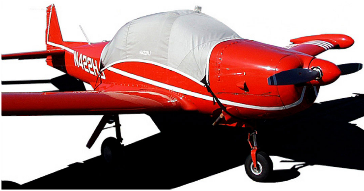
Navion Standard Canopy Cover on Long Slope Windshield Model