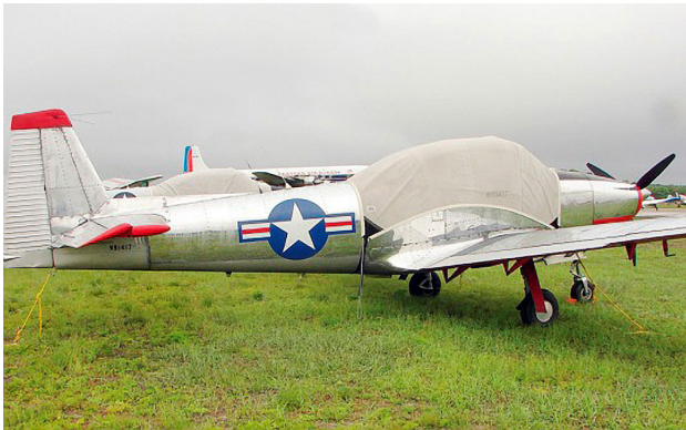
Navion Canopy Cover

This cover type is made from Silver Acrylic Sunbrella canvas and is 100% lined with a soft and smooth microfiber. Bruce's Custom Covers developed this material combination especially for aircraft protection. The outer material is medium weight and treated for water resistance, UV resistance and anti-static buildup. The inner lining is a very soft and smooth microfiber to prevent scratching. The material is very reflective, and tests show that the cabin interior temperature can be reduced to near-ambient temperature on the hottest of days. It is water, ice and snow repellent, yet breathable to allow moisture to escape from between the cover and the aircraft surface.