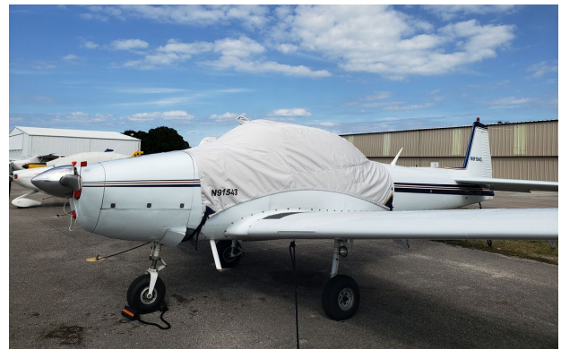
Ryan Navion Canopy Cover with Avionics Bay Extension