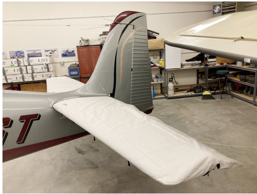
Navion Rangemaster Horizontal Stabilizer Covers

WINTER USE MATERIAL - Made with Solution-Dyed Polyester fabric, this option is intended for seasonal use to aid in deicing, rain mitigation, or for occasional travel. The material is lighter and more compact, but more susceptible to UV damage and may have a shorter useful life if used continuously outside than the all-year use material.