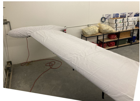
Navion Rangemaster Wing Covers