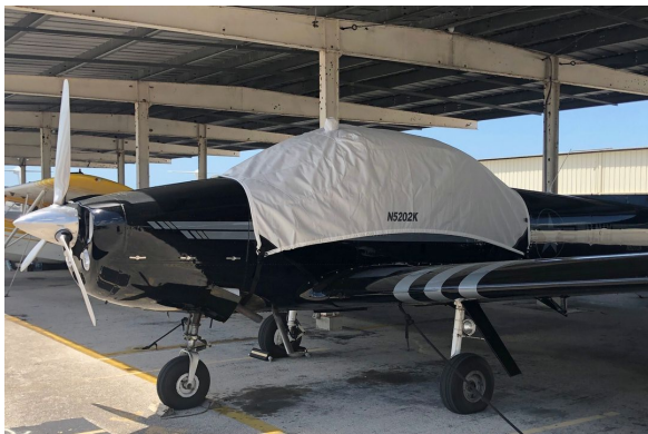
Navion L-17 Canopy cover with super slope windshield

This cover type is made from Silver Acrylic Sunbrella canvas and is 100% lined with a soft and smooth microfiber. Bruce's Custom Covers developed this material combination especially for aircraft protection. The outer material is medium weight and treated for water resistance, UV resistance and anti-static buildup. The inner lining is a very soft and smooth microfiber to prevent scratching. The material is very reflective, and tests show that the cabin interior temperature can be reduced to near-ambient temperature on the hottest of days. It is water, ice and snow repellent, yet breathable to allow moisture to escape from between the cover and the aircraft surface.