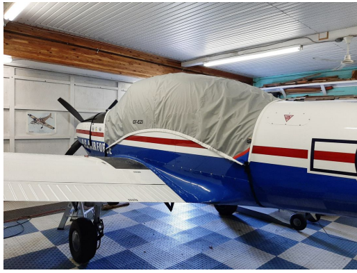
Navion L-17 Travel Cover, Light Weight Canopy Cover (w/out avionics bay extension)