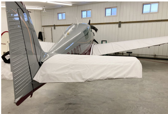
Navion Rangemaster Wing & Horizontal Stabilizer Covers

WINTER USE MATERIAL - Made with Solution-Dyed Polyester fabric, this option is intended for seasonal use to aid in deicing, rain mitigation, or for occasional travel. The material is lighter and more compact, but more susceptible to UV damage and may have a shorter useful life if used continuously outside than the all-year use material.