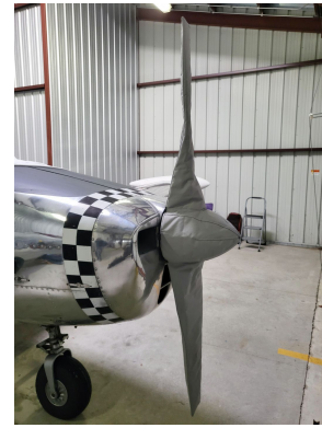
Navion L-17 Insulated Propellor/Spinner Cover, 2 Blade