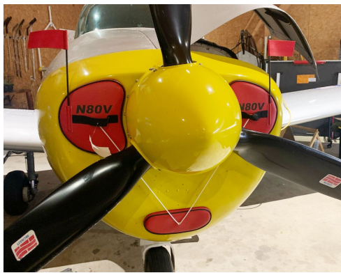
Navion L17 Engine Inlet Plugs