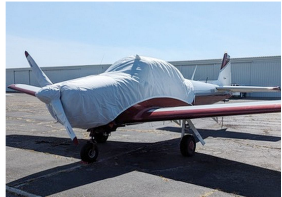
Navion Canopy/Engine Cover, Prop Cover