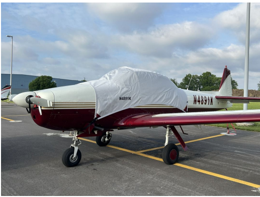
Navion Canopy Cover