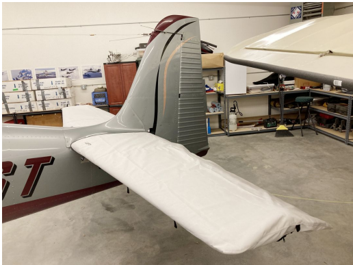
Navion Rangemaster Horizontal Stabilizer Covers