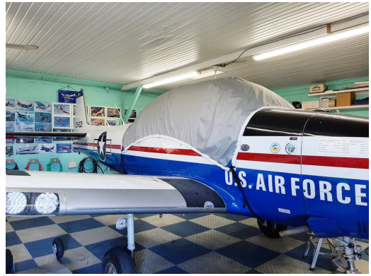
Navion L-17 Travel Cover, Light Weight Canopy Cover (without avionics bay extension)