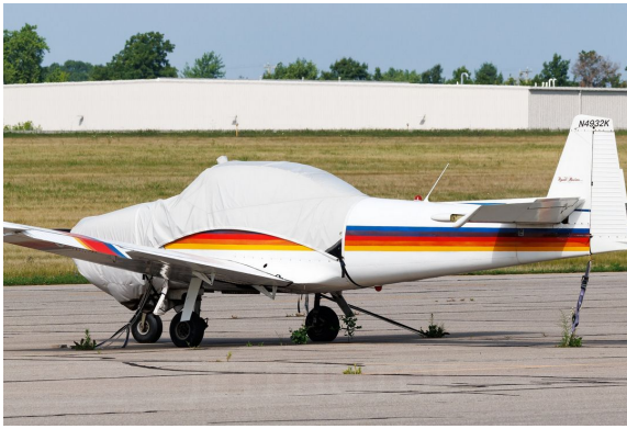
Navion Canopy Cover, Engine Cover (fully enclosed)