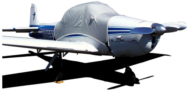
Navion Canopy Cover extends forward to firewall line.