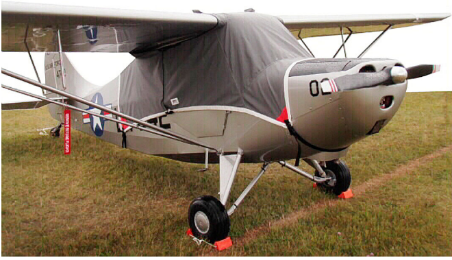
Aeronca Champ Canopy Cover