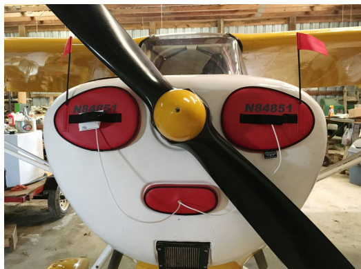
Aeronca 7AC Engine Inlet Plugs