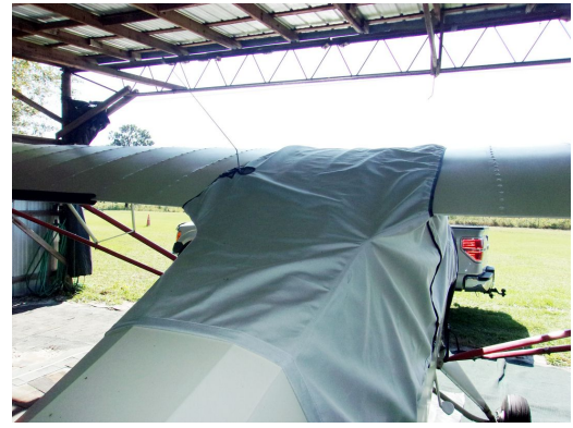
Aeronca 7AC Canopy Cover, Over Top Type