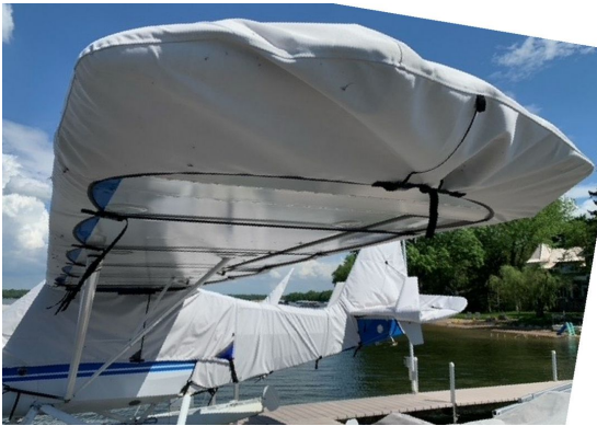
Aeronca 7GC Amphib Cover Set

WINTER USE MATERIAL - Made with Solution-Dyed Polyester fabric, this option is intended for seasonal use to aid in deicing, rain mitigation, or for occasional travel. The material is lighter and more compact, but more susceptible to UV damage and may have a shorter useful life if used continuously outside than the all-year use material.