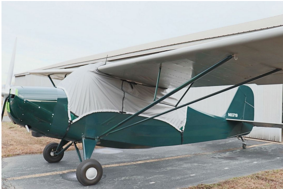
Aeronca 7AC Over-Top Canopy Cover, Light Weight Travel Type

This cover type is made from Silver Acrylic Sunbrella canvas and is 100% lined with a soft and smooth microfiber. Bruce's Custom Covers developed this material combination especially for aircraft protection. The outer material is medium weight and treated for water resistance, UV resistance and anti-static buildup. The inner lining is a very soft and smooth microfiber to prevent scratching. The material is very reflective, and tests show that the cabin interior temperature can be reduced to near-ambient temperature on the hottest of days. It is water, ice and snow repellent, yet breathable to allow moisture to escape from between the cover and the aircraft surface.