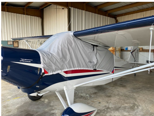
Aeronca Champ Travel Weight Canopy Cover

This cover type is made from Silver Acrylic Sunbrella canvas and is 100% lined with a soft and smooth microfiber. Bruce's Custom Covers developed this material combination especially for aircraft protection. The outer material is medium weight and treated for water resistance, UV resistance and anti-static buildup. The inner lining is a very soft and smooth microfiber to prevent scratching. The material is very reflective, and tests show that the cabin interior temperature can be reduced to near-ambient temperature on the hottest of days. It is water, ice and snow repellent, yet breathable to allow moisture to escape from between the cover and the aircraft surface.