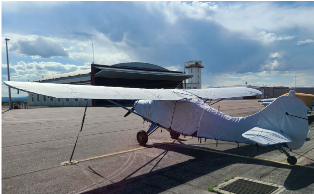
Champion 7EC Complete Cover Set

This cover type is made from Silver Acrylic Sunbrella canvas and is 100% lined with a soft and smooth microfiber. Bruce's Custom Covers developed this material combination especially for aircraft protection. The outer material is medium weight and treated for water resistance, UV resistance and anti-static buildup. The inner lining is a very soft and smooth microfiber to prevent scratching. The material is very reflective, and tests show that the cabin interior temperature can be reduced to near-ambient temperature on the hottest of days. It is water, ice and snow repellent, yet breathable to allow moisture to escape from between the cover and the aircraft surface.