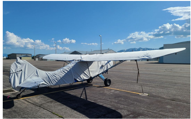
Champion 7EC Complete Cover Set