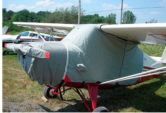
Aeronca Champ Extended Over-the-Top Canopy, Engine, and Propellor Covers