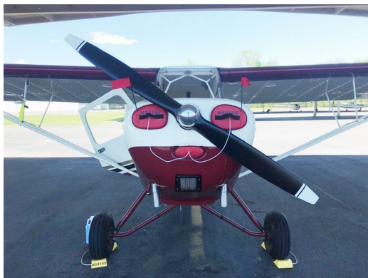
Aeronca Champ 7AC, 7EC Engine Inlet Plugs