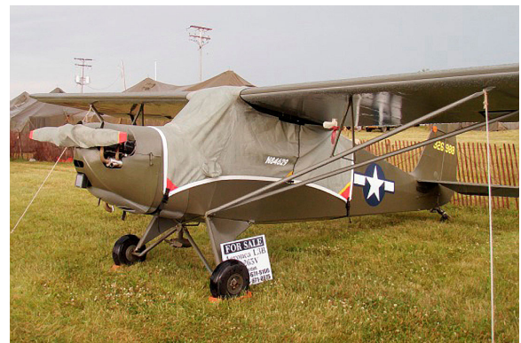
Aeronca 7AC Champ Canopy & Prop Covers