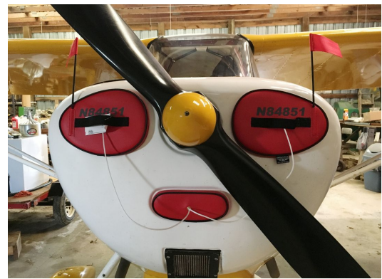
Aeronca 7AC Engine Inlet Plugs