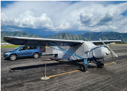
Champion 7EC Complete Cover Set