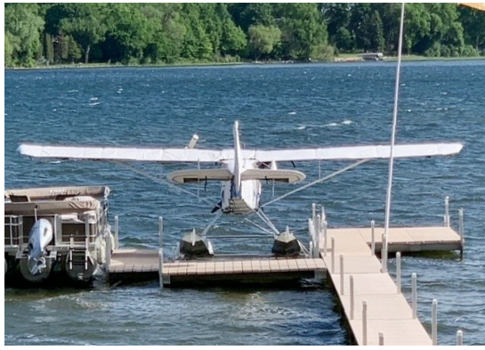
Aeronca 7GC Amphib Cover Set