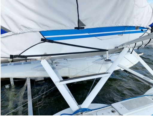
Aeronca 7GC Amphib Cover Set

This cover type is made from Silver Acrylic Sunbrella canvas and is 100% lined with a soft and smooth microfiber. Bruce's Custom Covers developed this material combination especially for aircraft protection. The outer material is medium weight and treated for water resistance, UV resistance and anti-static buildup. The inner lining is a very soft and smooth microfiber to prevent scratching. The material is very reflective, and tests show that the cabin interior temperature can be reduced to near-ambient temperature on the hottest of days. It is water, ice and snow repellent, yet breathable to allow moisture to escape from between the cover and the aircraft surface.