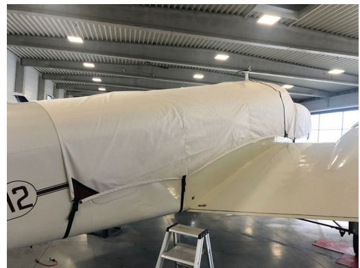
Lockheed 12 Canopy/Nose Cover