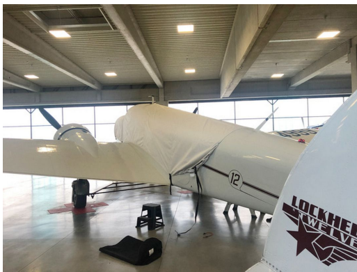
Lockheed 12 Canopy/Nose Cover

This cover type is made from Silver Acrylic Sunbrella canvas and is 100% lined with a soft and smooth microfiber. Bruce's Custom Covers developed this material combination especially for aircraft protection. The outer material is medium weight and treated for water resistance, UV resistance and anti-static buildup. The inner lining is a very soft and smooth microfiber to prevent scratching. The material is very reflective, and tests show that the cabin interior temperature can be reduced to near-ambient temperature on the hottest of days. It is water, ice and snow repellent, yet breathable to allow moisture to escape from between the cover and the aircraft surface.