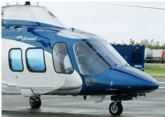
Agusta Grand Cabin & Skylight HeatShields

Cabin Heatshields are interior sunshades for the aircraft's passenger cabin area. The product is a unique composite of closed-cell foam with a silver mylar finish. The semi-rigid design is stiff enough to stand inside the window framing. The set folds up flat and is easily stored in the included storage sleeve. Some designs may require velcro and suction cups. A Heatshield is an excellent short-term remedy for cockpit overheating, but an external fabric cover is more effective for long-term protection.