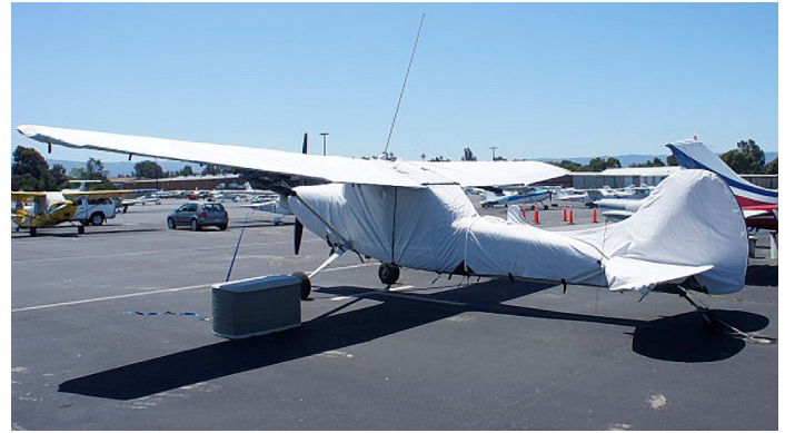
Cessna L-19 Extended Over-the-top Canopy, Engine, Empennage & Wing Covers