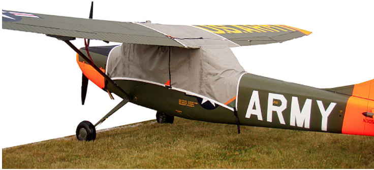
L-19 Canopy Cover

water resistance, UV resistance and anti-static buildup. The inner lining is a very soft and smooth microfiber to prevent scratching. The material is very reflective, and tests show that the cabin interior temperature can be reduced to near-ambient temperature on the hottest of days. It is water, ice and snow repellent, yet breathable to allow moisture to escape from between the cover and the aircraft surface.