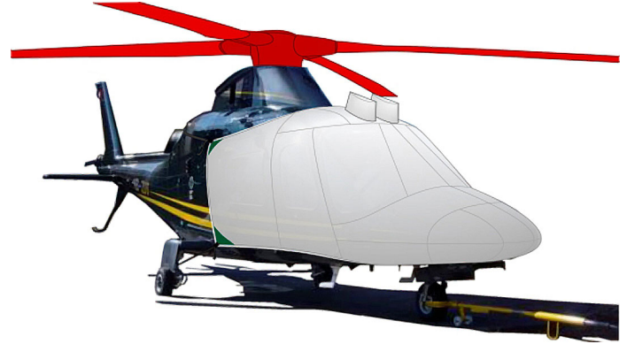
Agusta 109 Bubble, Rotor Hub & Blade Covers (illustration)