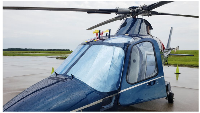
Agusta AW109S/SP Grand Heatshield Set