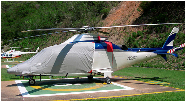
Agusta Grand Bubble Cover