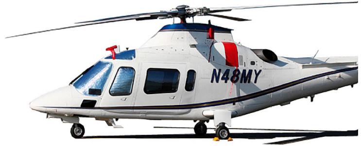
Agusta Power Pitot Covers, Intake Covers, and Cockpit Heatshield set