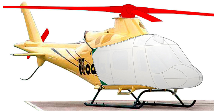
Koala Bubble, Rotor Hub, Blade & Tail Rotor Covers (illustration)