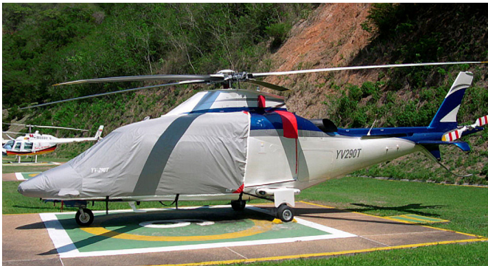
Agusta Grand Bubble Cover

Travel Covers are made with Silver Solution-Dyed Polyester fabric and fully lined over the entire cover. The material is lightweight and more compact for easy stowage in the aircraft. The polyester material is water resistant, but only intended for occasional use outside. We also have an ultra lightweight material available for fitted hangar dust covers. For daily outdoor use, the non-travel Sunbrella Cover is the best choice.