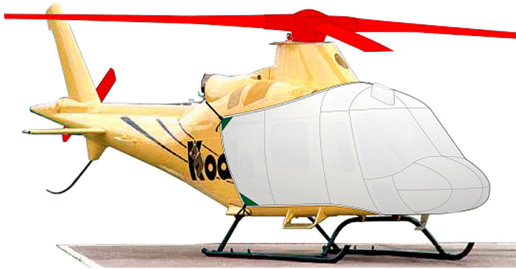
Koala Bubble, Rotor Hub, Blade & Tail Rotor Covers (illustration)

WINTER USE MATERIAL - Made with Solution-Dyed Polyester fabric, this option is intended for seasonal use to aid in deicing, rain mitigation, or for occasional travel. The material is lighter and more compact, but more susceptible to UV damage and may have a shorter useful life if used continuously outside than the all-year use material.