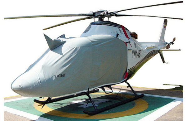
Koala Bubble Cover (with Wire Strike)