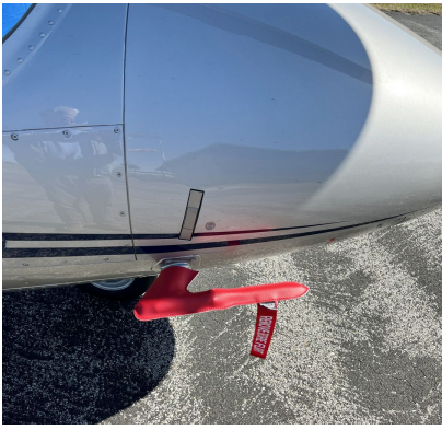
Agusta AW109 (A, C, & Trekker) Pitot Cover Set