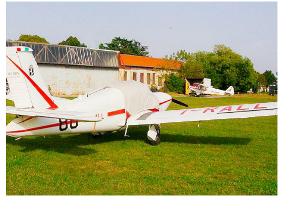
Standard Canopy Cover for MS893A