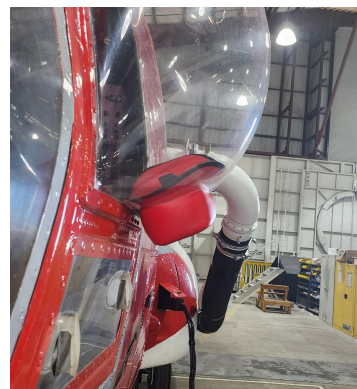
Boeing Vertol CH-47 Logger Window Plug