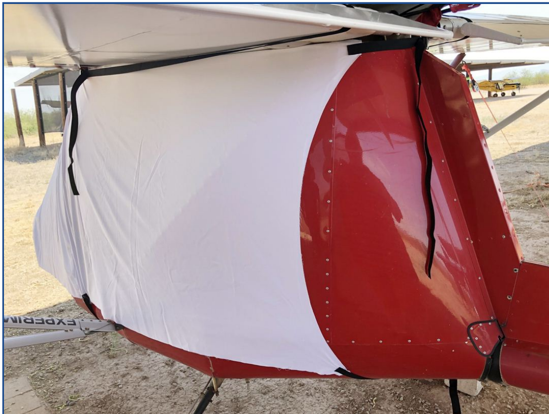
Rans S-12 Airaille Canopy/Nose Cover (test fit cover)