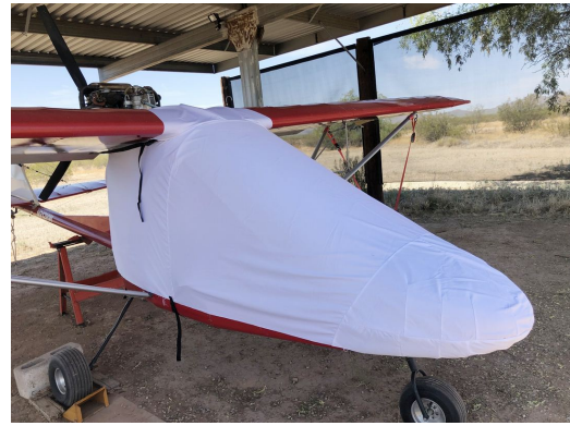
Rans S-12 Airaile Canopy/Nose Cover (test fit cover)