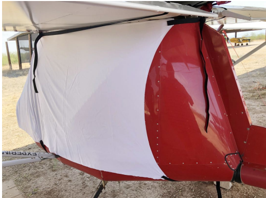
Rans S-12 Airaille Canopy/Nose Cover (test fit cover)

Travel Covers are made with Silver Solution-Dyed Polyester fabric and only lined over the windshield to save weight. The material is lightweight and more compact for easy stowage in the aircraft. The polyester material is water resistant, but only intended for occasional use outside. We also have an ultra lightweight material available for fitted hangar dust covers. For daily outdoor use, the non-travel Sunbrella Cover is the best choice.