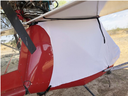
Rans S-12 Airaille Canopy/Nose Cover (test fit cover)