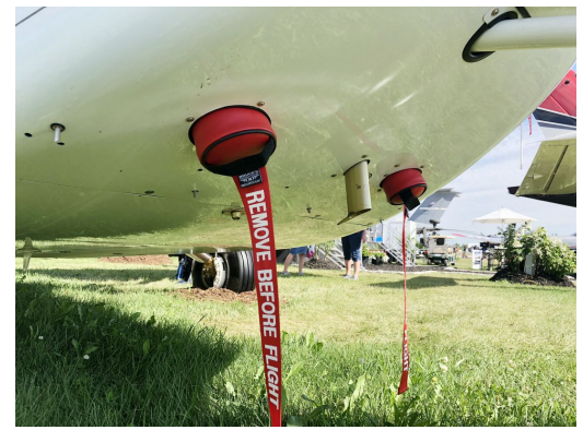
Quest Kodiak Lower Cowling Bypass Duct Plugs