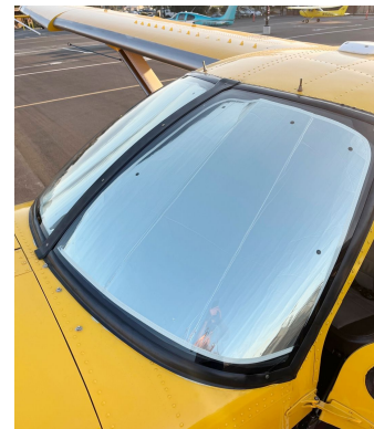
Quest Aircraft Kodiak Cockpit Heatshields