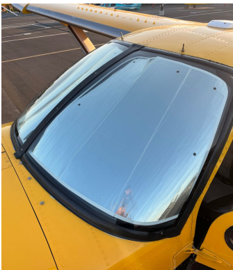
Quest Kodiak Windshield HeatShields

Cockpit Heatshields are interior sunshades for the aircraft's cockpit. The product is a unique composite of closed-cell foam with a silver mylar finish. The semi-rigid design is stiff enough to stand inside the window framing. The set folds up flat and is easily stored in the included storage sleeve. Some designs may require velcro and suction cups. A Heatshield is an excellent short-term remedy for cockpit overheating, but an external fabric cover is more effective for long-term protection.