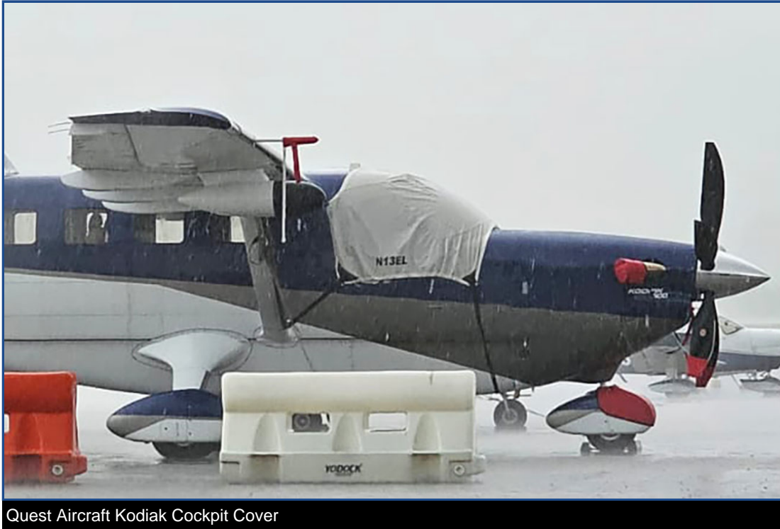
Quest Aircraft Kodiak Cockpit Cover