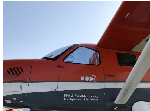
Quest Kodiak Cockpit HeatShields