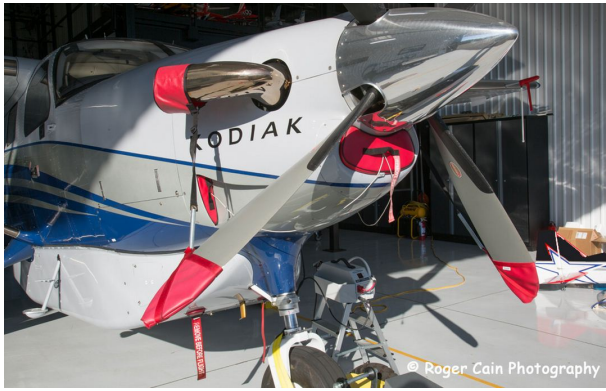
Quest Kodiak Engine Plugs, Prop Tie-Down & Exhaust Covers