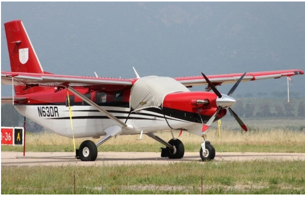
Quest Kodiak Cockpit Cover