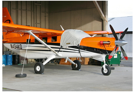
Quest Kodiak Cockpit Cover, Engine Plugs, Prop Tie/Exhaust Covers, & Cabin HeatShields set