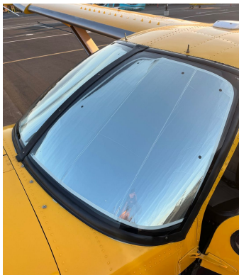
Quest Kodiak Windshield HeatShields

Cockpit Heatshields are interior sunshades for the aircraft's cockpit. The product is a unique composite of closed-cell foam with a silver mylar finish. The semi-rigid design is stiff enough to stand inside the window framing. The set folds up flat and is easily stored in the included storage sleeve. Some designs may require velcro and suction cups. A Heatshield is an excellent short-term remedy for cockpit overheating, but an external fabric cover is more effective for long-term protection.