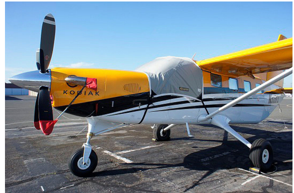
Quest Kodiak Cockpit Cover, Engine Plugs, Prop Tie/Exhaust Covers, & Cabin HeatShields set