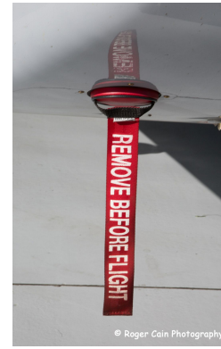
Quest Kodiak Lower Cowling Bypass Duct Plugs