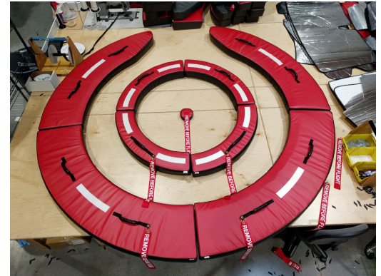
Boeing 747-8 Exhaust Plugs