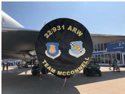
Boeing KC-46 Intake Cover