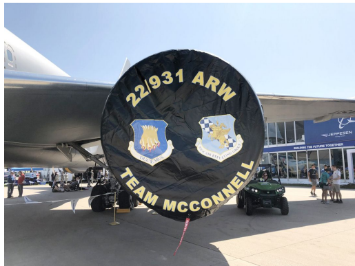
Boeing KC-46 Intake Cover