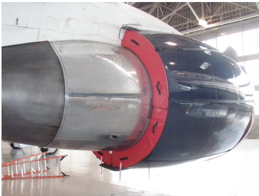
Boeing 767 Exhaust Plugs Ship Set, incl. Fan Thrust Reverser and Exhaust Plugs P/N: B767-200