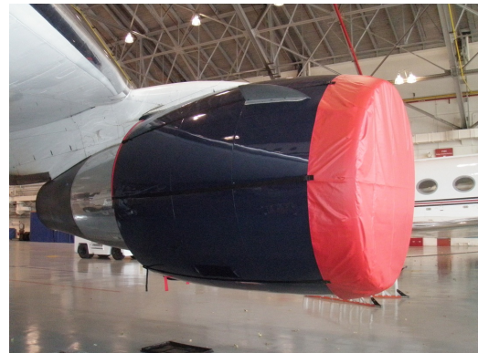
Boeing 767 Intake Covers Ship Set