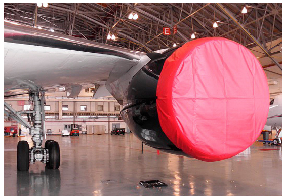
Boeing 767 Intake Covers Ship Set