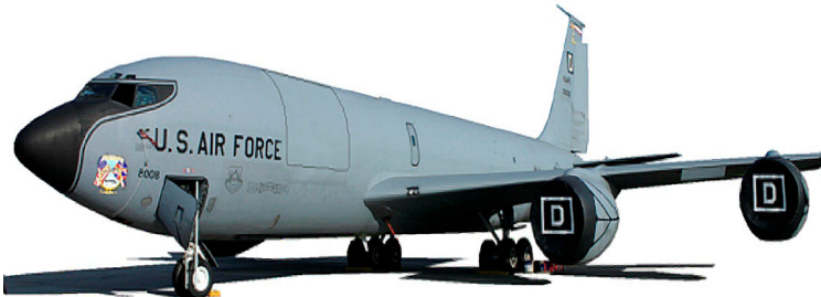
KC-135 "soft" type Intake Covers