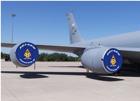
BOEING KC-135 Tambourine Type Double Fold Intake Covers, Custom Mesh Insert & IUID's with custom Imprint

The Boeing KC-135, C-135, RC-135, EC-135 Intake Covers are designed to install easily yet be completely storable. A spring steel hoop is sewn into the hem of each cover, allowing them to be installed without climbing onto the wing or using a stepladder. To store the covers the spring steel hoop folds like a band-saw blade into three nesting rings. Each cover folds into a compact circular bundle which is stored in the included duffle bag, yet they unfold quickly for use. The Tri-Fold Ring cover is made of medium weight nylon which is available in a variety of colors to match the paint trim. Each cover set comes complete with installation and folding instructions. The aircraft's registration number can be silkscreened onto the cover for an extra charge.