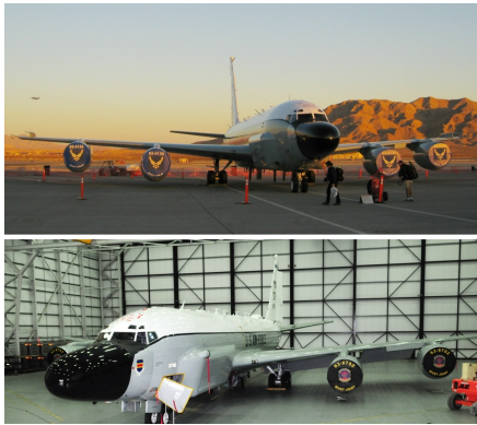
KC-135 & RC-135 Intake Covers, Tamborine Type

The Boeing KC-135, C-135, RC-135, EC-135 Intake Covers are designed to install easily yet be completely storable. A spring steel hoop is sewn into the hem of each cover, allowing them to be installed without climbing onto the wing or using a stepladder. To store the covers the spring steel hoop folds like a band-saw blade into three nesting rings. Each cover folds into a compact circular bundle which is stored in the included duffle bag, yet they unfold quickly for use. The Tri-Fold Ring cover is made of medium weight nylon which is available in a variety of colors to match the paint trim. Each cover set comes complete with installation and folding instructions. The aircraft's registration number can be silkscreened onto the cover for an extra charge.