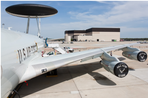
Boeing E-3C Engine Covers