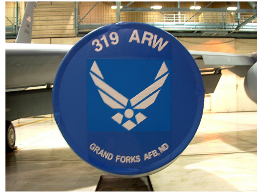
KC-135 "Tambourine" type Intake Cover