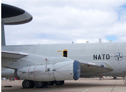
E-3 Sentry Intake/Exhaust Covers set

The Engine Inlet Plugs are custom fit for your Boeing KC-135, C-135, RC-135, EC-135 intakes, made with heavy-duty vinyl material, and stuffed with a single block of sculpted urethane foam. Each plug has a zipper that allows the foam to be removed and dried if necessary. Engine plugs have 'remove before flight' streamers sewn onto the face of the plugs. Most plugs are imprinted with the aircraft registration number in black for an extra charge. Storage bag NOT included. Engine plugs may be inserted after flight when the engine is still warm. Engine Inlet Plugs are commonly referred to as Cowl Plugs, Intake Plugs, Cowl Blocks, Engine Blocks, and Engine Bungs.