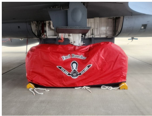
Boeing KC-135 Main Gear Tire Covers