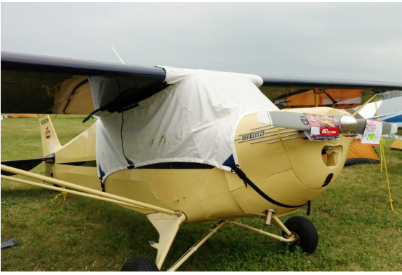
Piper J-4 Cub Coupe Canopy Cover (Over-Top)