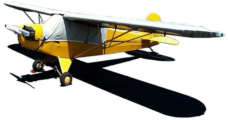
Piper J3 Canopy, Wing and Prop Covers