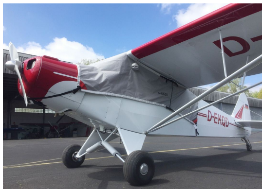
Piper Super Cub Travel Weight Canopy Cover

This cover type is made from Silver Acrylic Sunbrella canvas and is 100% lined with a soft and smooth microfiber. Bruce's Custom Covers developed this material combination especially for aircraft protection. The outer material is medium weight and treated for water resistance, UV resistance and anti-static buildup. The inner lining is a very soft and smooth microfiber to prevent scratching. The material is very reflective, and tests show that the cabin interior temperature can be reduced to near-ambient temperature on the hottest of days. It is water, ice and snow repellent, yet breathable to allow moisture to escape from between the cover and the aircraft surface.