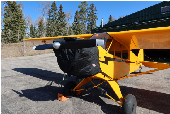
Piper J3 Cub Insulated Engine Cover