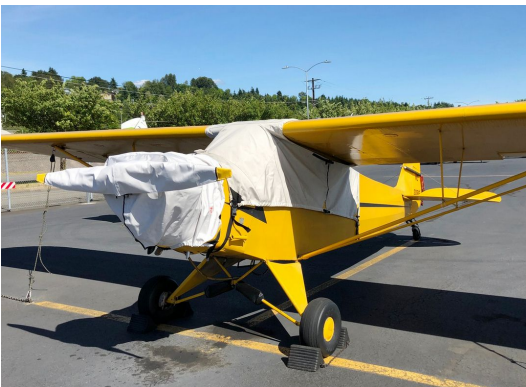
Piper J3C-65 Engine Cover (open on bottom)

This cover type is made from Silver Acrylic Sunbrella canvas and is 100% lined with a soft and smooth microfiber. Bruce's Custom Covers developed this material combination especially for aircraft protection. The outer material is medium weight and treated for water resistance, UV resistance and anti-static buildup. The inner lining is a very soft and smooth microfiber to prevent scratching. The material is very reflective, and tests show that the cabin interior temperature can be reduced to near-ambient temperature on the hottest of days. It is water, ice and snow repellent, yet breathable to allow moisture to escape from between the cover and the aircraft surface.