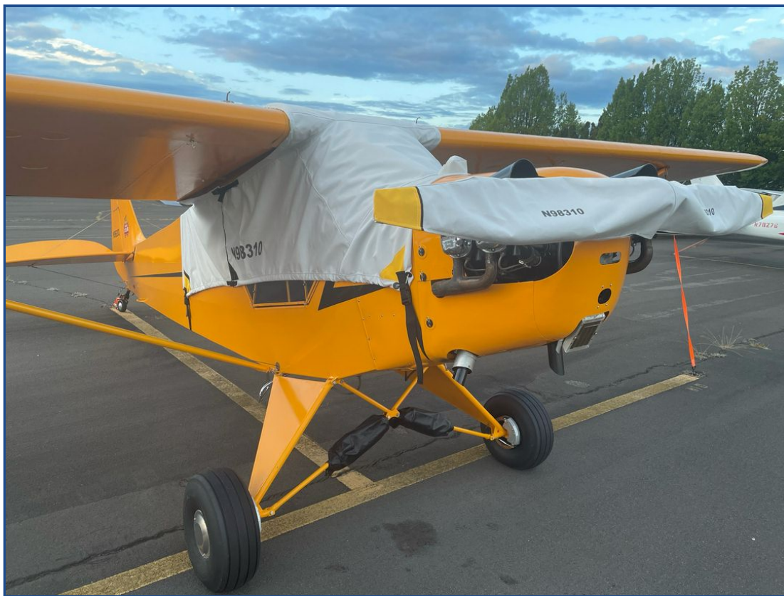
Piper J3 Canopy Cover, Prop Cover