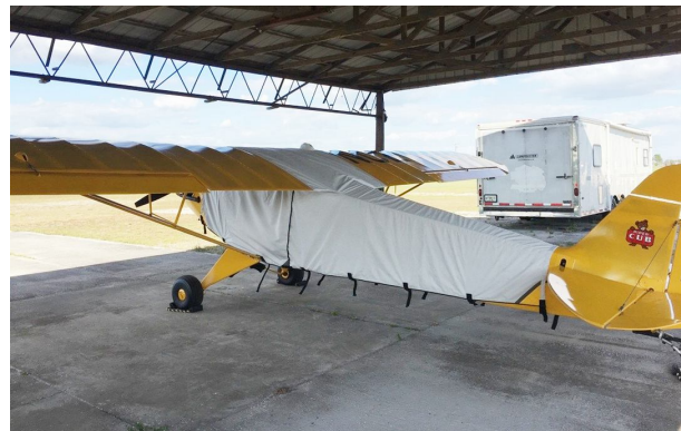
Piper J3 Cub Extended Canopy Cover, also extended back to tail planes.