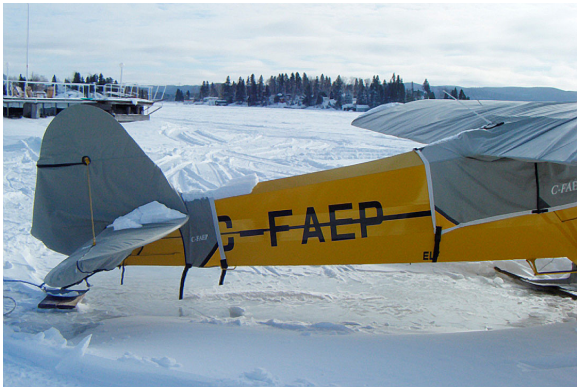
Piper J3 Cub Abbreviated Empennage Cover, Wing Covers and Canopy Cover