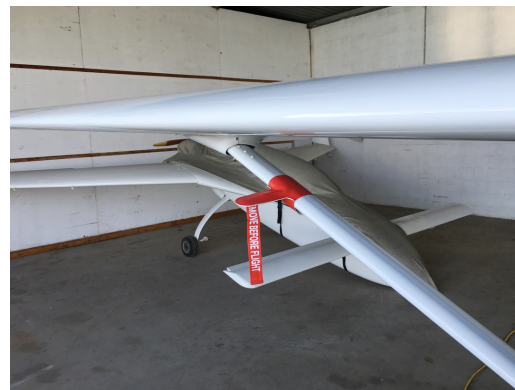
Jabiru Pitot Cover