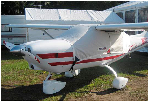
Jabiru 230-SP Canopy Cover, Over-top style