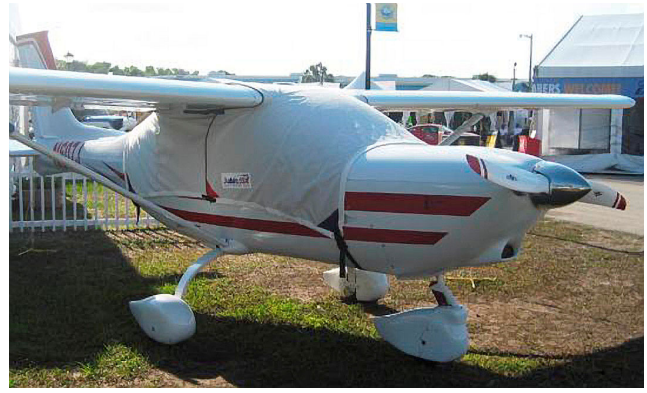
Jabiru 230-SP Canopy Cover, Over-top style