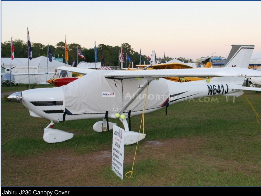
Jabiru J230 Canopy Cover