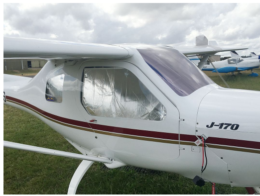
Jabiru 170 Heatshield Set