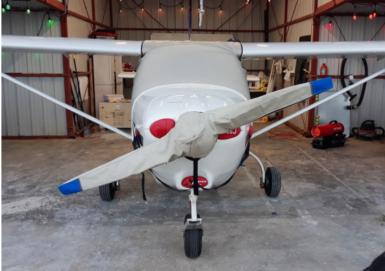
Jabiru J250 Canopy & Prop Cover

This cover type is made from Silver Acrylic Sunbrella canvas and is 100% lined with a soft and smooth microfiber. Bruce's Custom Covers developed this material combination especially for aircraft protection. The outer material is medium weight and treated for water resistance, UV resistance and anti-static buildup. The inner lining is a very soft and smooth microfiber to prevent scratching. The material is very reflective, and tests show that the cabin interior temperature can be reduced to near-ambient temperature on the hottest of days. It is water, ice and snow repellent, yet breathable to allow moisture to escape from between the cover and the aircraft surface.