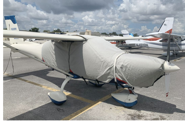
Jabiru 230D Extended Canopy Cover & Engine Covers