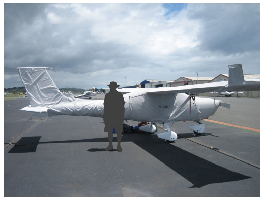
Jabiru J430 Complete Cover Set