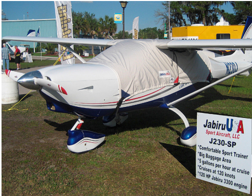
Jabiru 230-SP Canopy Cover, Over-top style

This cover type is made from Silver Acrylic Sunbrella canvas and is 100% lined with a soft and smooth microfiber. Bruce's Custom Covers developed this material combination especially for aircraft protection. The outer material is medium weight and treated for water resistance, UV resistance and anti-static buildup. The inner lining is a very soft and smooth microfiber to prevent scratching. The material is very reflective, and tests show that the cabin interior temperature can be reduced to near-ambient temperature on the hottest of days. It is water, ice and snow repellent, yet breathable to allow moisture to escape from between the cover and the aircraft surface.