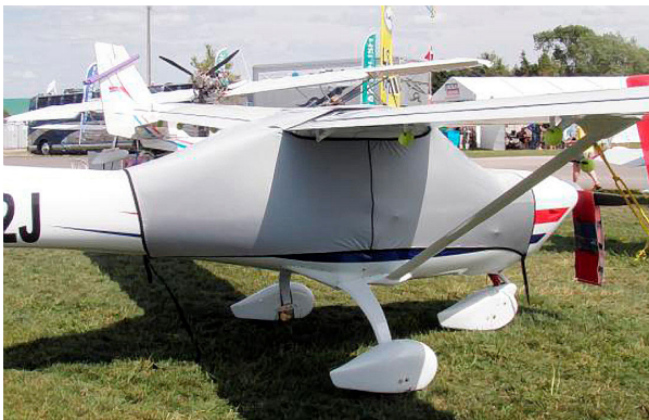
Jabiru Spandex FlyAway Travel Canopy Cover

Travel Covers are made with Silver Solution-Dyed Polyester fabric and only lined over the windshield to save weight. The material is lightweight and more compact for easy stowage in the aircraft. The polyester material is water resistant, but only intended for occasional use outside. We also have an ultra lightweight material available for fitted hangar dust covers. For daily outdoor use, the non-travel Sunbrella Cover is the best choice.