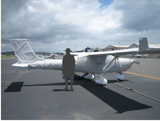
Jabiru J430 Complete Cover Set

WINTER USE MATERIAL - Made with Solution-Dyed Polyester fabric, this option is intended for seasonal use to aid in deicing, rain mitigation, or for occasional travel. The material is lighter and more compact, but more susceptible to UV damage and may have a shorter useful life if used continuously outside than the all-year use material.