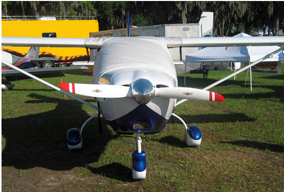
Jabiru 230-SP Canopy Cover, Over-top style