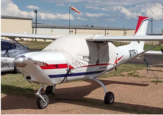
Jabiru 230SP Canopy Cover

This cover type is made from Silver Acrylic Sunbrella canvas and is 100% lined with a soft and smooth microfiber. Bruce's Custom Covers developed this material combination especially for aircraft protection. The outer material is medium weight and treated for water resistance, UV resistance and anti-static buildup. The inner lining is a very soft and smooth microfiber to prevent scratching. The material is very reflective, and tests show that the cabin interior temperature can be reduced to near-ambient temperature on the hottest of days. It is water, ice and snow repellent, yet breathable to allow moisture to escape from between the cover and the aircraft surface.