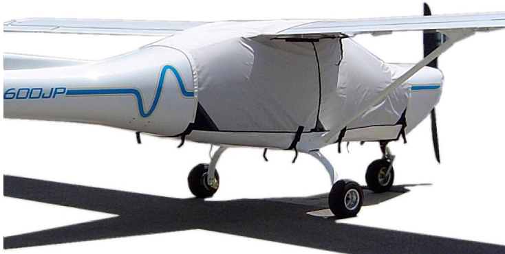
Jabiru Extended Canopy Cover

This cover type is made from Silver Acrylic Sunbrella canvas and is 100% lined with a soft and smooth microfiber. Bruce's Custom Covers developed this material combination especially for aircraft protection. The outer material is medium weight and treated for water resistance, UV resistance and anti-static buildup. The inner lining is a very soft and smooth microfiber to prevent scratching. The material is very reflective, and tests show that the cabin interior temperature can be reduced to near-ambient temperature on the hottest of days. It is water, ice and snow repellent, yet breathable to allow moisture to escape from between the cover and the aircraft surface.