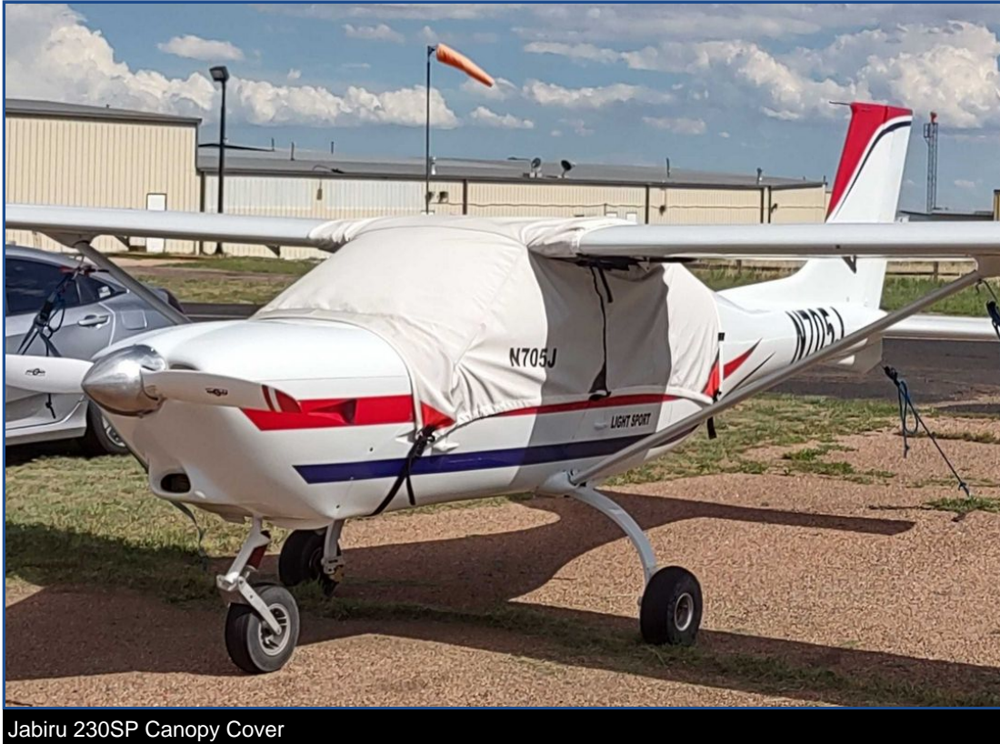
Jabiru 230SP Canopy Cover