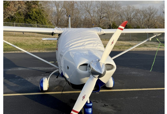
Jabiru J230-SP Extended Canopy Cover