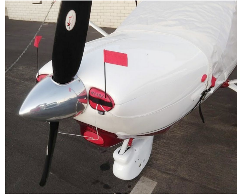
Jabiru 430 Engine Inlet Plugs