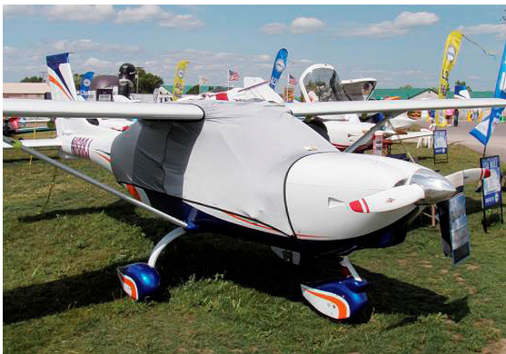
Jabiru Spandex FlyAway Travel Canopy Cover