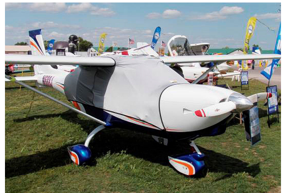
Jabiru Spandex FlyAway Travel Canopy Cover