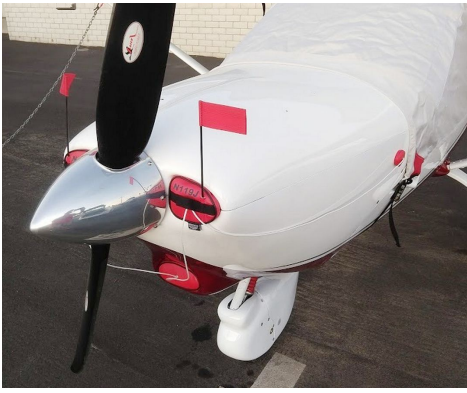
Jabiru 430 Engine Inlet Plugs