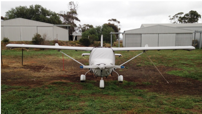
Jabiru 160 Canopy, Engine, Prop, Wings & Empennage Covers