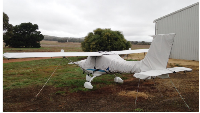
Jabiru 160 Canopy, Engine, Prop, Wings & Empennage Covers