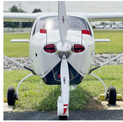
Jabiru J230-SP Engine Inlet Plugs