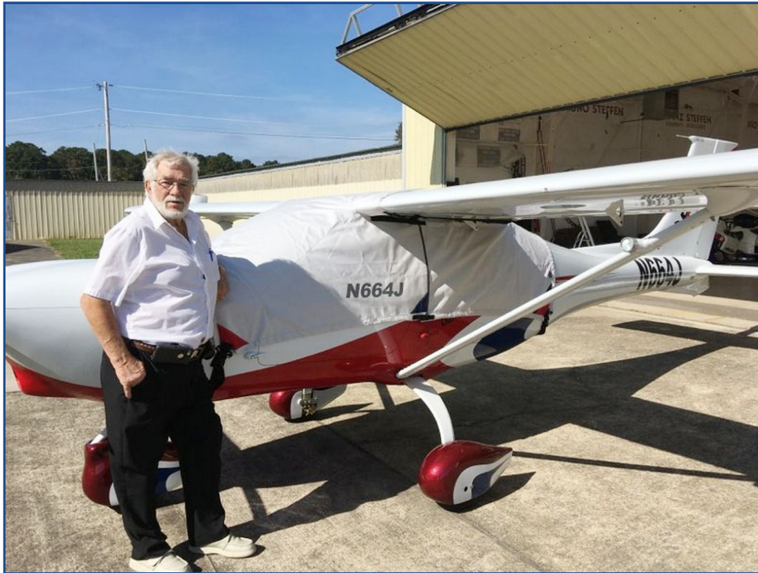
Jabiru 230SP Canopy Cover, Over-Top Style