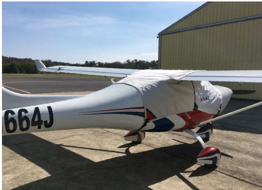
Jabiru J230-SP Canopy Cover, Over-Top Style

This cover type is made from Silver Acrylic Sunbrella canvas and is 100% lined with a soft and smooth microfiber. Bruce's Custom Covers developed this material combination especially for aircraft protection. The outer material is medium weight and treated for water resistance, UV resistance and anti-static buildup. The inner lining is a very soft and smooth microfiber to prevent scratching. The material is very reflective, and tests show that the cabin interior temperature can be reduced to near-ambient temperature on the hottest of days. It is water, ice and snow repellent, yet breathable to allow moisture to escape from between the cover and the aircraft surface.