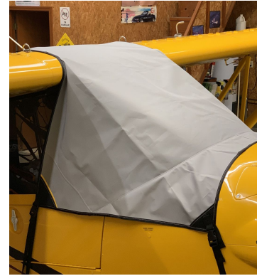
Cub Crafters Carbon Cub FX3 Windshield/Skylight Cover, travel weight