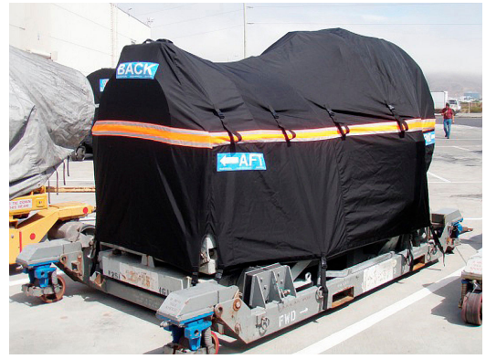
IAE V2500 QEC OFF-LINK JET ENGINE COVER, "rain cap" style