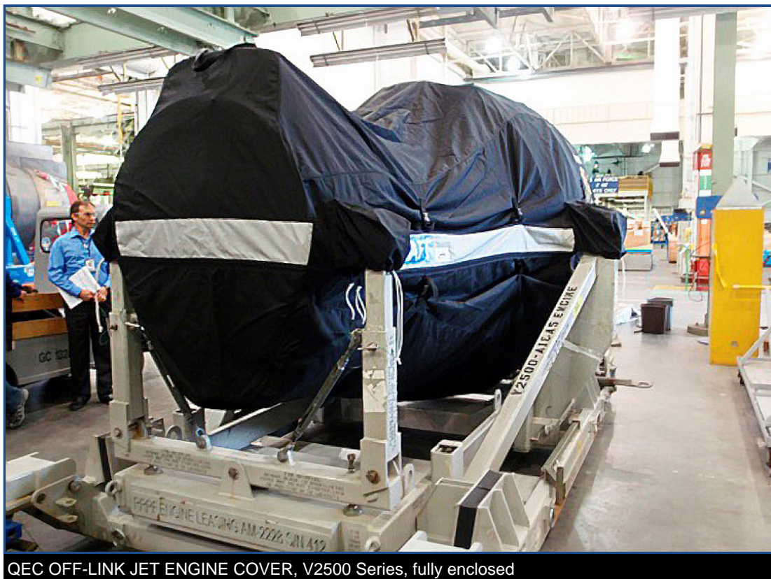
QEC OFF-LINK JET ENGINE COVER, V2500 Series, fully enclosed