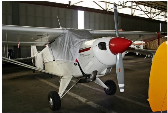
Aviat Husky Canopy Cover, Empennage Cover