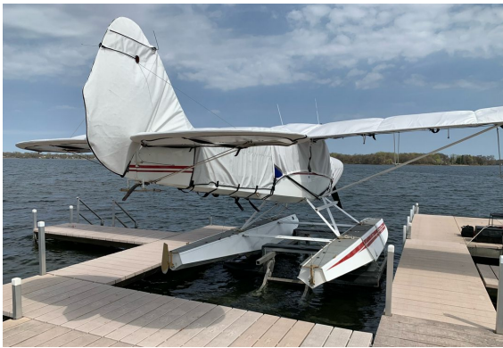
Aviat Husky Empennage Cover

This cover type is made from Silver Acrylic Sunbrella canvas and is 100% lined with a soft and smooth microfiber. Bruce's Custom Covers developed this material combination especially for aircraft protection. The outer material is medium weight and treated for water resistance, UV resistance and anti-static buildup. The inner lining is a very soft and smooth microfiber to prevent scratching. The material is very reflective, and tests show that the cabin interior temperature can be reduced to near-ambient temperature on the hottest of days. It is water, ice and snow repellent, yet breathable to allow moisture to escape from between the cover and the aircraft surface.