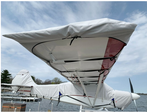
Aviat Husky Canopy, Engine, Wing, Empennage Covers

This cover type is made from Silver Acrylic Sunbrella canvas and is 100% lined with a soft and smooth microfiber. Bruce's Custom Covers developed this material combination especially for aircraft protection. The outer material is medium weight and treated for water resistance, UV resistance and anti-static buildup. The inner lining is a very soft and smooth microfiber to prevent scratching. The material is very reflective, and tests show that the cabin interior temperature can be reduced to near-ambient temperature on the hottest of days. It is water, ice and snow repellent, yet breathable to allow moisture to escape from between the cover and the aircraft surface.