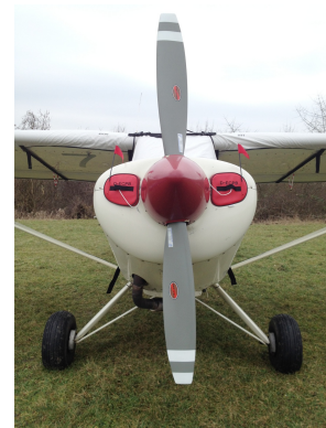
Aviat Husky Engine Plugs, Wing Covers