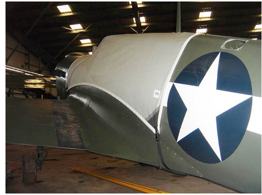
P40 Canopy Cover