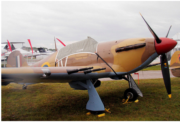
Hawker Hurricane Canopy Cover