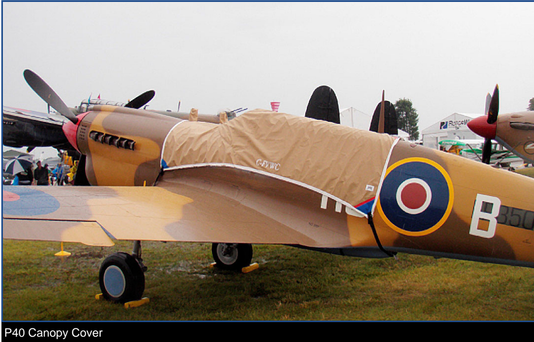
P40 Canopy Cover