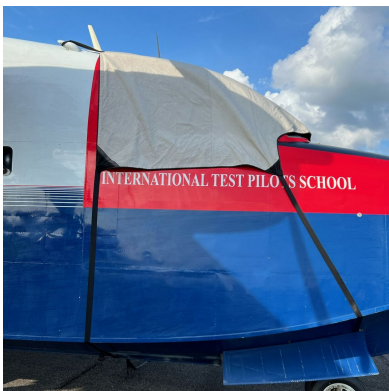
Grumman Albatross Cockpit Cover