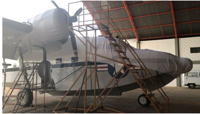
Grumman HU-16 Albatross Cockpit/Nose Cover and Engine Cover(test fit covers)