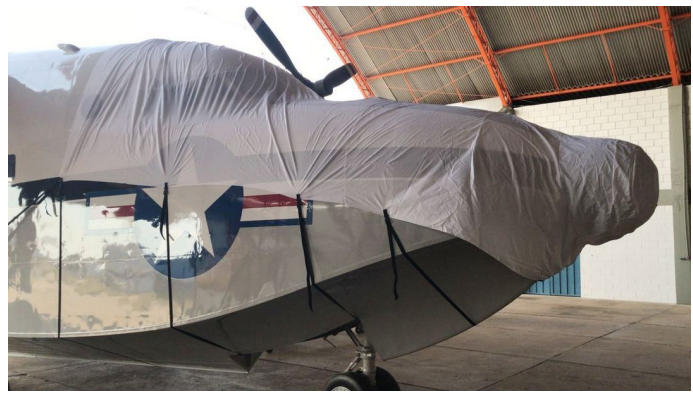
Grumman HU-16 Albatross Cockpit/Nose Cover (test fit cover)