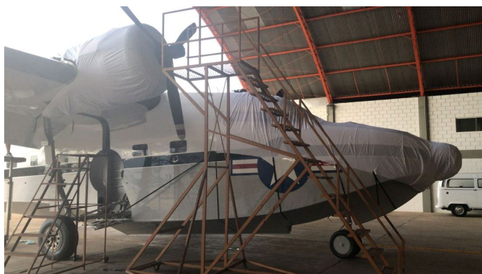
Grumman HU-16 Albatross Cockpit/Nose Cover and Engine Cover(test fit covers)

This cover type is made from Silver Acrylic Sunbrella canvas and is 100% lined with a soft and smooth microfiber. Bruce's Custom Covers developed this material combination especially for aircraft protection. The outer material is medium weight and treated for water resistance, UV resistance and anti-static buildup. The inner lining is a very soft and smooth microfiber to prevent scratching. The material is very reflective, and tests show that the cabin interior temperature can be reduced to near-ambient temperature on the hottest of days. It is water, ice and snow repellent, yet breathable to allow moisture to escape from between the cover and the aircraft surface.