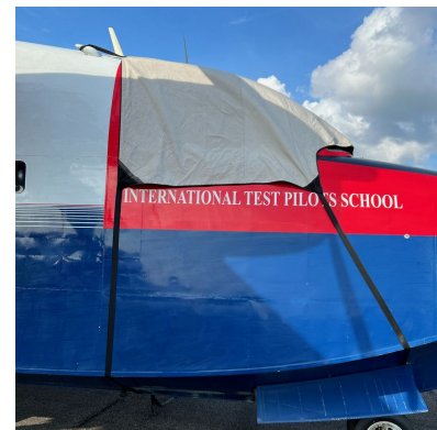
Grumman Albatross Cockpit Cover