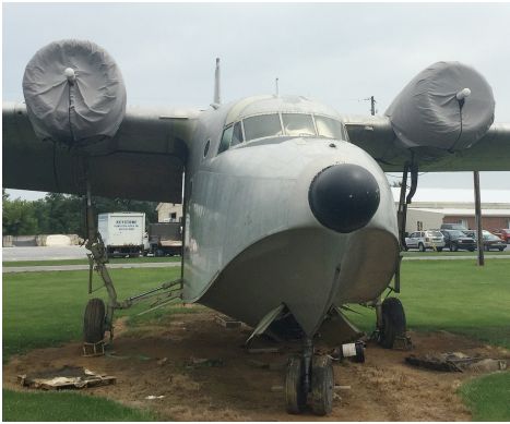
Grumman Albatross Engine Covers

This cover type is made from Silver Acrylic Sunbrella canvas and is 100% lined with a soft and smooth microfiber. Bruce's Custom Covers developed this material combination especially for aircraft protection. The outer material is medium weight and treated for water resistance, UV resistance and anti-static buildup. The inner lining is a very soft and smooth microfiber to prevent scratching. The material is very reflective, and tests show that the cabin interior temperature can be reduced to near-ambient temperature on the hottest of days. It is water, ice and snow repellent, yet breathable to allow moisture to escape from between the cover and the aircraft surface.