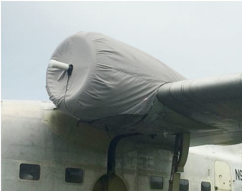
Grumman Albatross Engine Covers

This cover type is made from Silver Acrylic Sunbrella canvas and is 100% lined with a soft and smooth microfiber. Bruce's Custom Covers developed this material combination especially for aircraft protection. The outer material is medium weight and treated for water resistance, UV resistance and anti-static buildup. The inner lining is a very soft and smooth microfiber to prevent scratching. The material is very reflective, and tests show that the cabin interior temperature can be reduced to near-ambient temperature on the hottest of days. It is water, ice and snow repellent, yet breathable to allow moisture to escape from between the cover and the aircraft surface.