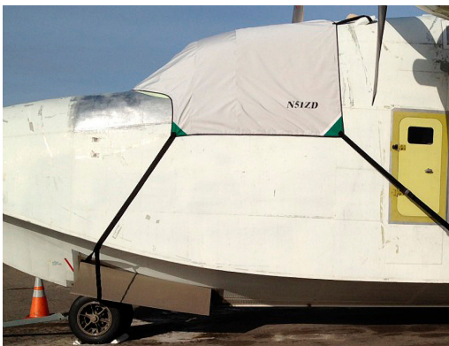
Grumman HU-16 Albatross Canopy Cover

This cover type is made from Silver Acrylic Sunbrella canvas and is 100% lined with a soft and smooth microfiber. Bruce's Custom Covers developed this material combination especially for aircraft protection. The outer material is medium weight and treated for water resistance, UV resistance and anti-static buildup. The inner lining is a very soft and smooth microfiber to prevent scratching. The material is very reflective, and tests show that the cabin interior temperature can be reduced to near-ambient temperature on the hottest of days. It is water, ice and snow repellent, yet breathable to allow moisture to escape from between the cover and the aircraft surface.