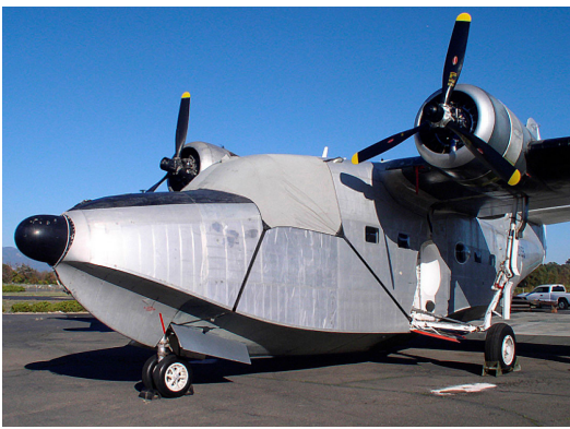
Canopy Cover for the Grumman HU-16 Albatross

This cover type is made from Silver Acrylic Sunbrella canvas and is 100% lined with a soft and smooth microfiber. Bruce's Custom Covers developed this material combination especially for aircraft protection. The outer material is medium weight and treated for water resistance, UV resistance and anti-static buildup. The inner lining is a very soft and smooth microfiber to prevent scratching. The material is very reflective, and tests show that the cabin interior temperature can be reduced to near-ambient temperature on the hottest of days. It is water, ice and snow repellent, yet breathable to allow moisture to escape from between the cover and the aircraft surface.