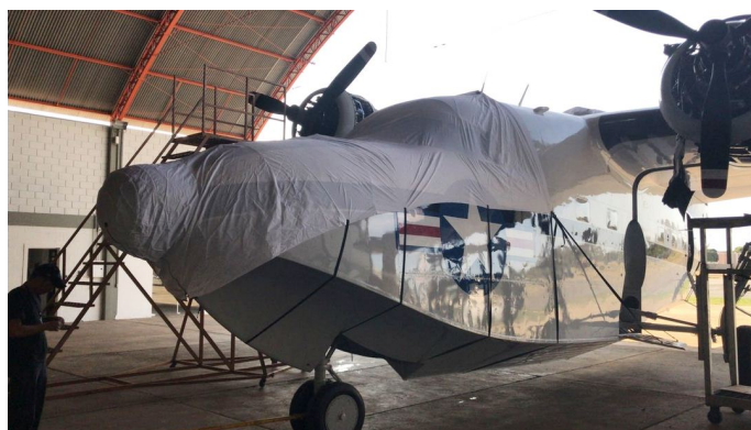
Grumman HU-16 Albatross Cockpit/Nose Cover (test fit cover)