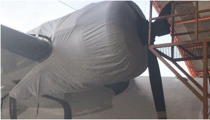
Grumman HU-16 Albatross Engine Cover (test fit cover)

This cover type is made from Silver Acrylic Sunbrella canvas and is 100% lined with a soft and smooth microfiber. Bruce's Custom Covers developed this material combination especially for aircraft protection. The outer material is medium weight and treated for water resistance, UV resistance and anti-static buildup. The inner lining is a very soft and smooth microfiber to prevent scratching. The material is very reflective, and tests show that the cabin interior temperature can be reduced to near-ambient temperature on the hottest of days. It is water, ice and snow repellent, yet breathable to allow moisture to escape from between the cover and the aircraft surface.