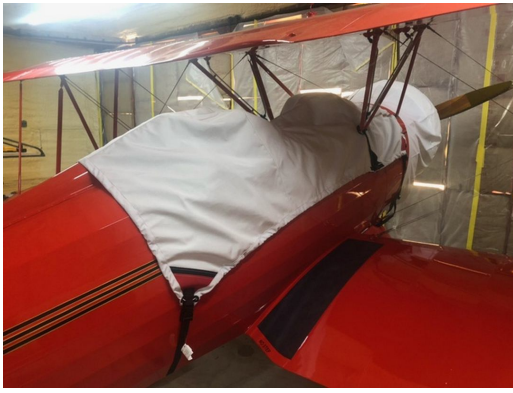
Hatz CB-1 Biplane Canopy & Engine Covers