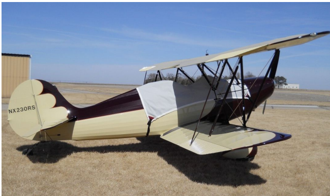
Hatz Biplane Canopy Cover

This cover type is made from Silver Acrylic Sunbrella canvas and is 100% lined with a soft and smooth microfiber. Bruce's Custom Covers developed this material combination especially for aircraft protection. The outer material is medium weight and treated for water resistance, UV resistance and anti-static buildup. The inner lining is a very soft and smooth microfiber to prevent scratching. The material is very reflective, and tests show that the cabin interior temperature can be reduced to near-ambient temperature on the hottest of days. It is water, ice and snow repellent, yet breathable to allow moisture to escape from between the cover and the aircraft surface.