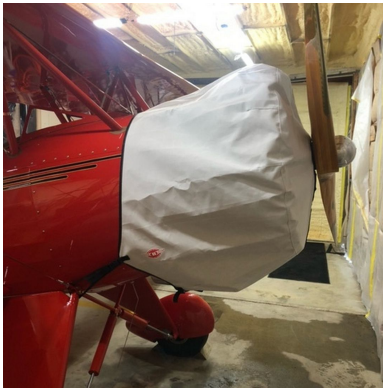
Hatz Biplane CB-1 Engine Cover