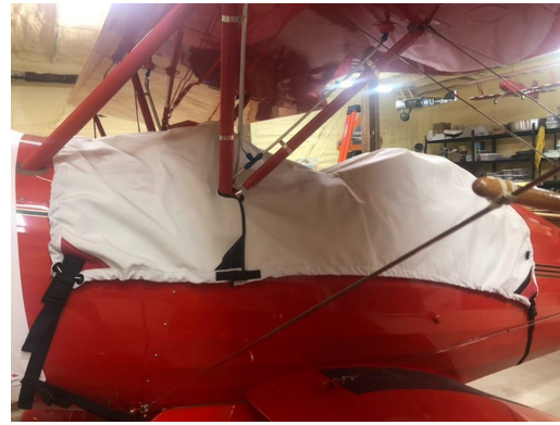
Hatz Biplane CB-1 Canopy Cover