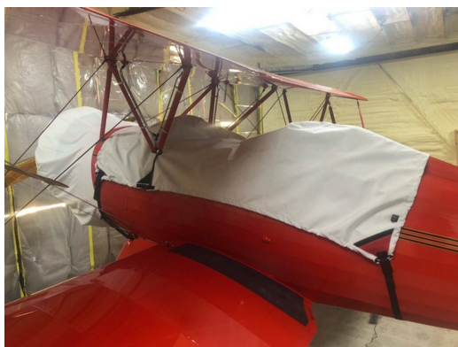
Hatz Biplane CB-1 Canopy Cover & Engine Cover