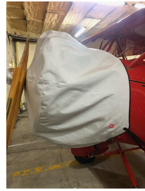
Hatz Biplane CB-1 Engine Cover