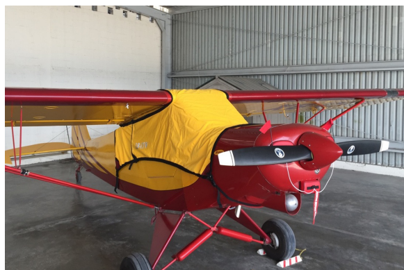
Piper Super Cub Canopy Cover, Engine Plugs

Engine Inlet Plugs are custom fit for your Hatz Biplane CB-1 intakes, made with heavy-duty vinyl material, and stuffed with a single block of sculpted urethane foam. Each plug has a zipper that allows the foam to be removed and dried if necessary. Engine plugs have warning flags that are visible from the cockpit or 'remove before flight' streamers sewn onto the face of the plugs. Most plugs are imprinted with the aircraft registration number in black for an extra charge. Storage bag NOT included. Engine plugs may be inserted after flight when the engine is still warm. Engine Inlet Plugs are commonly referred to as Cowl Plugs, Intake Plugs, Cowl Blocks, Engine Blocks, and Engine Bungs.