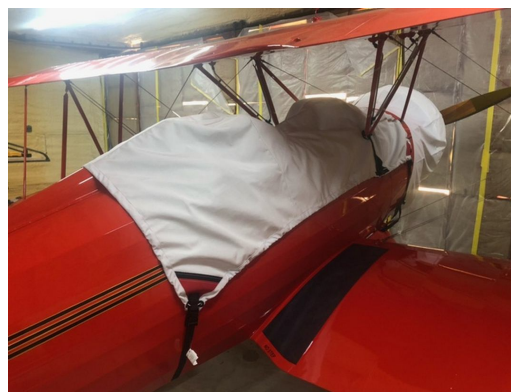
Hatz CB-1 Biplane Canopy & Engine Covers