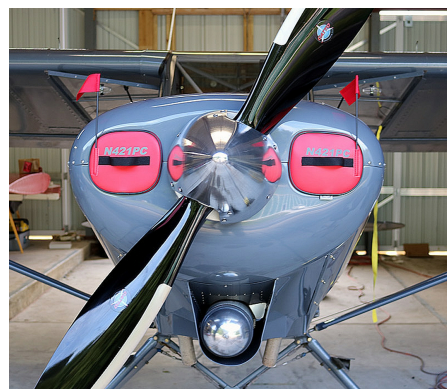
Piper PA-18 Super Cub Engine Inlet Plugs