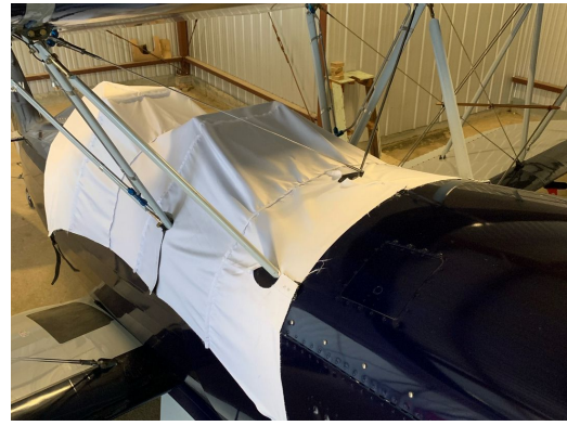
Hatz Biplane Canopy Cover, test fit cover