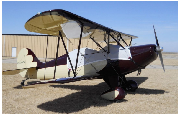
Hatz Biplane Canopy Cover