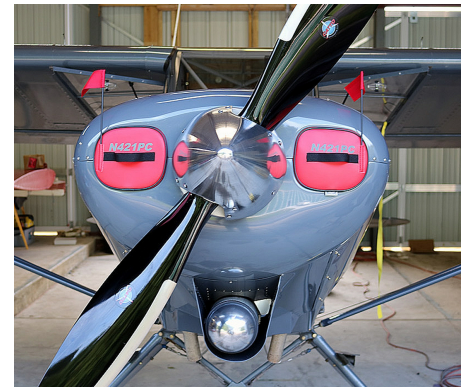
Piper PA-18 Super Cub Engine Inlet Plugs