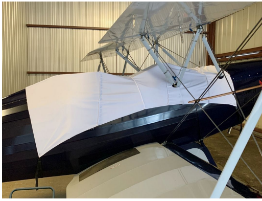
Hatz Biplane Canopy Cover, test fit cover