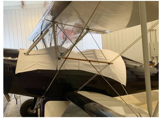
Hatz Biplane Canopy Cover, test fit cover