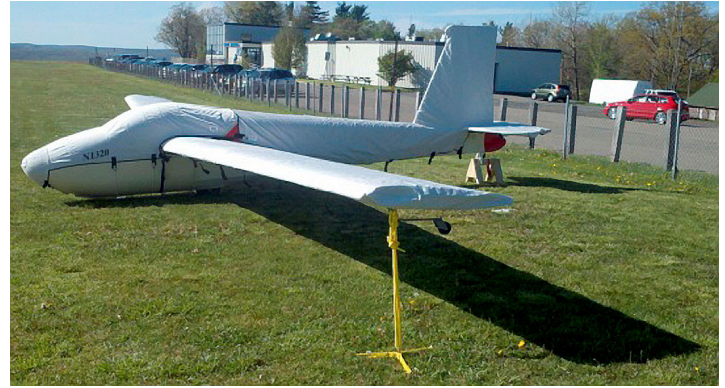
SGS 1-26B Canopy/Nose, Empennage & Wing Covers