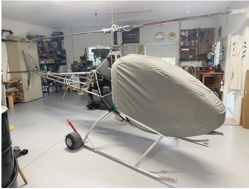
Eagle Helicycle Bubble Cover

This cover type is made from Silver Acrylic Sunbrella canvas and is 100% lined with a soft and smooth microfiber. Bruce's Custom Covers developed this material combination especially for aircraft protection. The outer material is medium weight and treated for water resistance, UV resistance and anti-static buildup. The inner lining is a very soft and smooth microfiber to prevent scratching. The material is very reflective, and tests show that the cabin interior temperature can be reduced to near-ambient temperature on the hottest of days. It is water, ice and snow repellent, yet breathable to allow moisture to escape from between the cover and the aircraft surface.