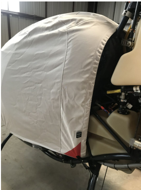
Helicycle Bubble Cover