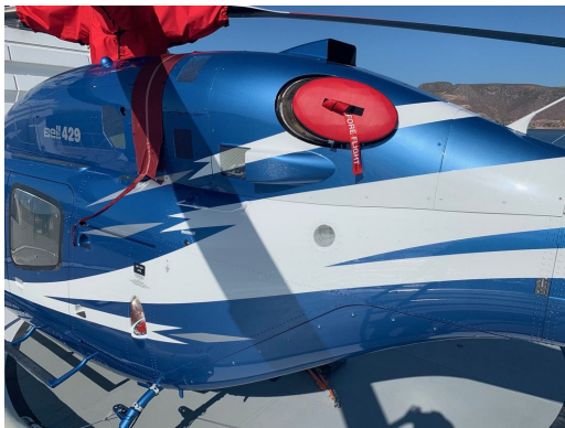
Bell 429 Exhaust Plug

The Engine Exhaust Plugs are custom fit for your Eagle R&D Helicycle exhaust openings, made with heavy-duty vinyl material, and stuffed with a single block of sculpted urethane foam. Exhaust plugs have 'Remove Before Flight' streamers sewn onto the face of the plugs. Exhaust plugs may be inserted soon after flight when the engine is still warm. Engine Inlet Plugs are commonly referred to as Cowl Plugs, Intake Plugs, Cowl Blocks, Engine Blocks, and Engine Bungs.