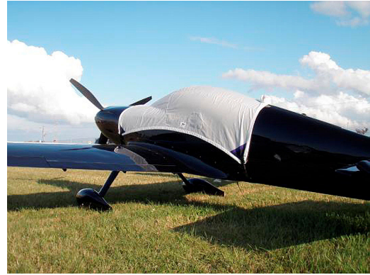
Harmon Rocket Canopy Cover