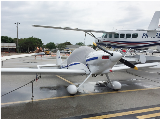
Van's RV-4/Harmon Rocket Travel Cover

occasional use outside. We also have an ultra lightweight material available for fitted hangar dust covers. For daily outdoor use, the non-travel Sunbrella Cover is the best choice.