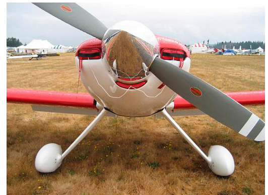
Harmon Rocket Engine Inlet Plugs