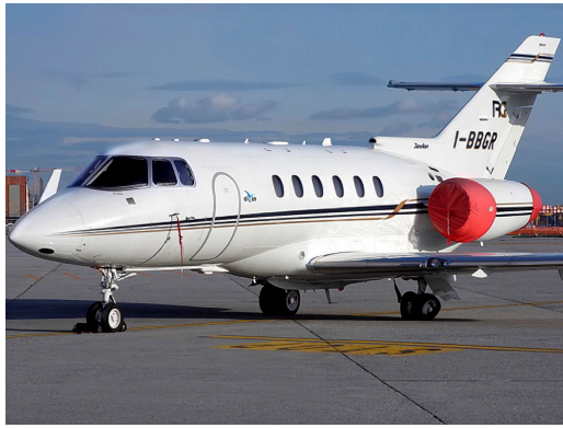
Hawker 900XP Tri-Fold Engine Intake/Exhaust Cover Set