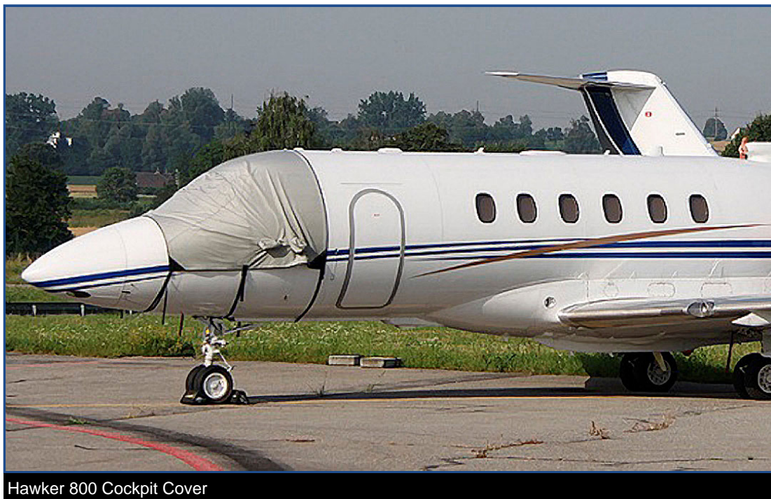
Hawker 800 Cockpit Cover