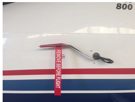
Hawker Beechcraft 800, 800XP, 850XP Pitot Covers With Aoa Straps

The Engine Inlet Plugs are custom fit for your Hawker Beechcraft 900XP intakes, made with heavy-duty vinyl material, and stuffed with a single block of sculpted urethane foam. Each plug has a zipper that allows the foam to be removed and dried if necessary. Engine plugs have 'remove before flight' streamers sewn onto the face of the plugs. Most plugs are imprinted with the aircraft registration number in black for an extra charge. Storage bag NOT included. Engine plugs may be inserted after flight when the engine is still warm. Engine Inlet Plugs are commonly referred to as Cowl Plugs, Intake Plugs, Cowl Blocks, Engine Blocks, and Engine Bunges.