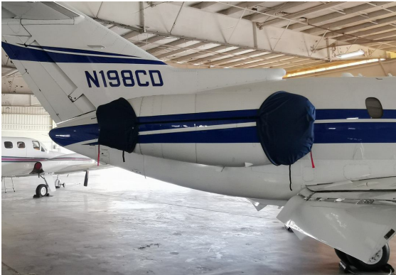
Hawker 750 Engine Covers

Cockpit Heatshields are interior sunshades for the aircraft's cockpit. The product is a unique composite of closed-cell foam with a silver mylar finish. The semi-rigid design is stiff enough to stand inside the window framing. The set folds up flat and is easily stored in the included storage sleeve. Some designs may require velcro and suction cups. Our Heatshields for jets are offered white side out because some aircraft manufacturers have issued advisories against reflective window inserts due to potential heat damage. A Heatshield is an excellent short-term remedy for cockpit overheating, but an external fabric cover is more effective for long-term protection.