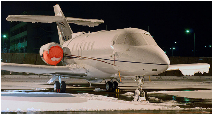
Engine Covers & Pitot Cover Set