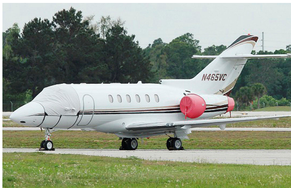
Hawker 800 Cockpit Cover and Engine Covers set