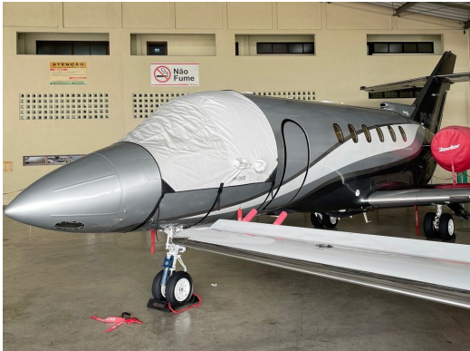
Hawker Beechcraft 750, 800, 800XP, 850XP Cockpit Cover