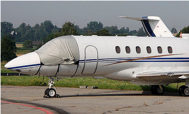
Hawker 800 Cockpit Cover

This cover type is made from Silver Acrylic Sunbrella canvas and is 100% lined with a soft and smooth microfiber. Bruce's Custom Covers developed this material combination especially for aircraft protection. The outer material is medium weight and treated for water resistance, UV resistance and anti-static buildup. The inner lining is a very soft and smooth microfiber to prevent scratching. The material is very reflective, and tests show that the cabin interior temperature can be reduced to near-ambient temperature on the hottest of days. It is water, ice and snow repellent, yet breathable to allow moisture to escape from between the cover and the aircraft surface.