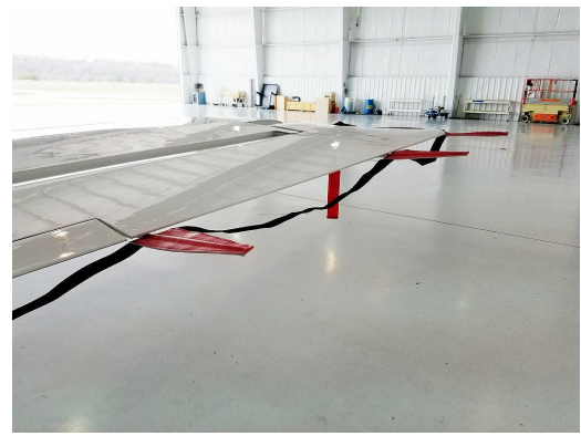
Hawker Beechcraft 800, 800XP, 850XP Static Wick Protectors