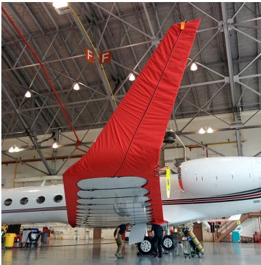
Gulfstream G550 Wing/Winglet Covers