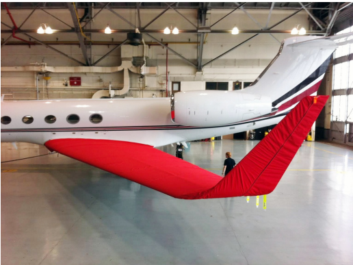
Gulfstream G550 Wing/Winglet Covers

WINTER USE MATERIAL - Made with Solution-Dyed Polyester fabric, this option is intended for seasonal use to aid in deicing, rain mitigation, or for occasional travel. The material is lighter and more compact, but more susceptible to UV damage and may have a shorter useful life if used continuously outside than the all-year use material.