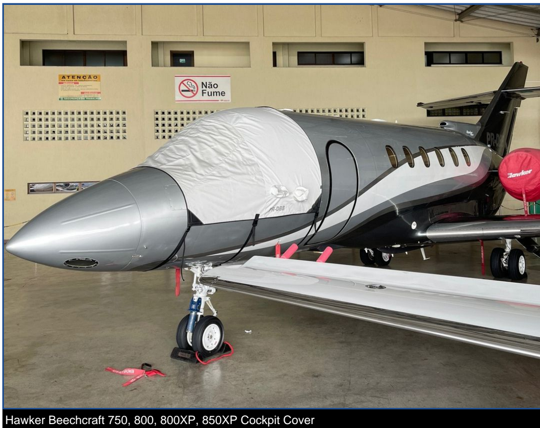
Hawker Beechcraft 750, 800, 800XP, 850XP Cockpit Cover