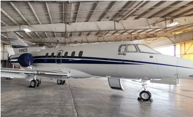
Hawker 750 HeatShields & Engine Covers