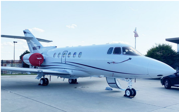
Hawker 800XP Engine Covers (with TR's) set of 4

instructions. The aircraft's registration number can be silkscreened onto the cover for an extra charge.