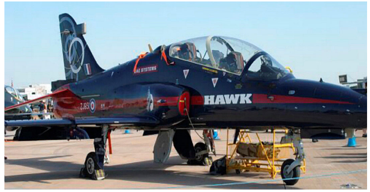
Covers, Plugs, HeatShields and related items for the British Aerospace Hawk 108