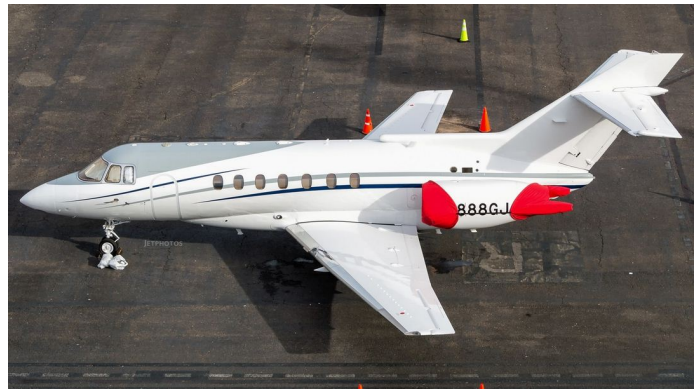
Hawker 1000 Engine Covers