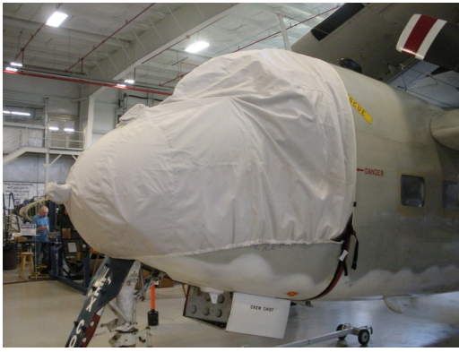
Grumman Tracker Canopy/Nose Cover