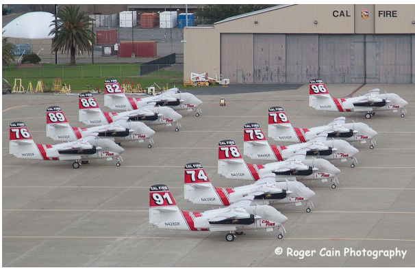
Grumman S-2 Tracker Canopy/Nose Cover