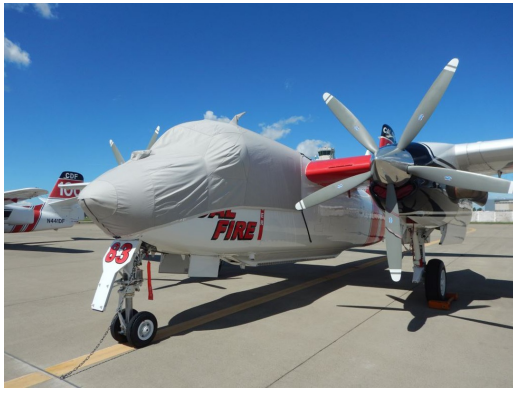
Grumman Tracker Canopy/Nose Cover