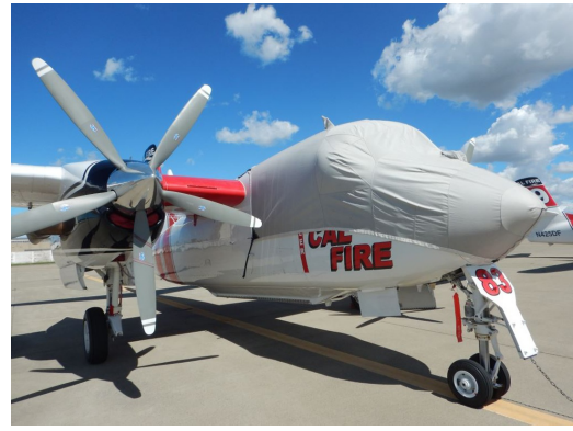
Grumman Tracker Canopy/Nose Cover