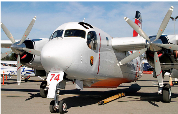
Grumman Tracker Engine Inlet Plugs

Engine Inlet Plugs are custom fit for your Grumman S-2 Tracker intakes, made with heavy-duty vinyl material, and stuffed with a single block of sculpted urethane foam. Each plug has a zipper that allows the foam to be removed and dried if necessary. Engine plugs have warning flags that are visible from the cockpit or 'remove before flight' streamers sewn onto the face of the plugs. Most plugs are imprinted with the aircraft registration number in black for an extra charge. Storage bag NOT included. Engine plugs may be inserted after flight when the engine is still warm. Engine Inlet Plugs are commonly referred to as Cowl Plugs, Intake Plugs, Cowl Blocks, Engine Blocks, and Engine Bungs.