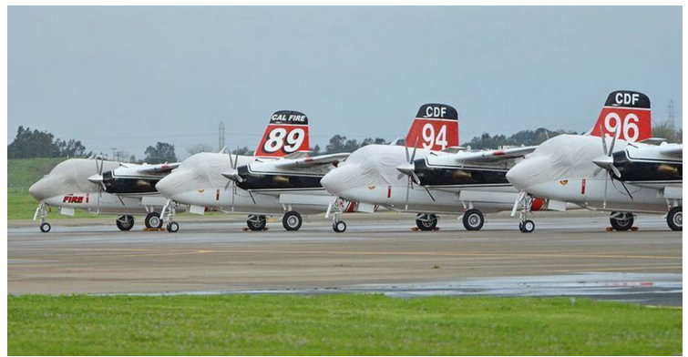
Grumman S2 Tracker Canopy/Nose Covers