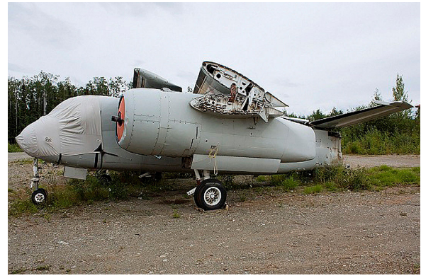
Grumman Tracker Canopy/Nose Cover