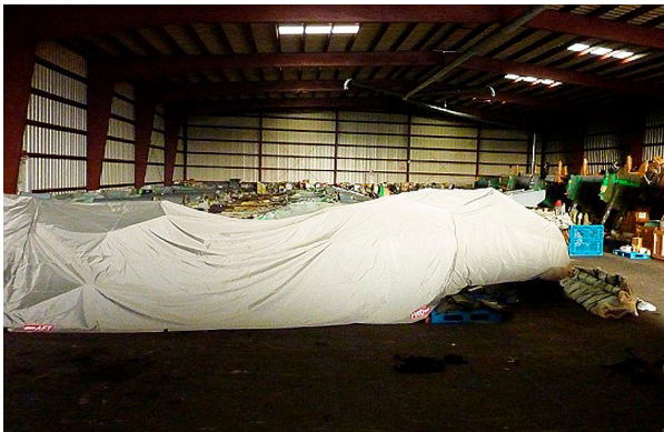
GR-7/9 FULL FUSELAGE COVER , NSN's: 1730-01-600-4557 GR-7/9 FULL FUSELAGE COVER , NSN's: 1730-01-600-4557 & 1730-01-600-6757, single seat