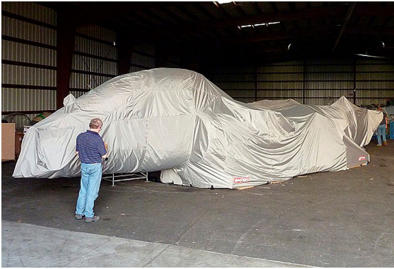
GR-7/9 FULL FUSELAGE COVER , NSN's: 1730-01-600-4557 & 1730-01-600-6757, dual seat

This cover type is made from Silver Acrylic Sunbrella canvas and is 100% lined with a soft and smooth microfiber. Bruce's Custom Covers developed this material combination especially for aircraft protection. The outer material is medium weight and treated for water resistance, UV resistance and anti-static buildup. The inner lining is a very soft and smooth microfiber to prevent scratching. The material is very reflective, and tests show that the cabin interior temperature can be reduced to near-ambient temperature on the hottest of days. It is water, ice and snow repellent, yet breathable to allow moisture to escape from between the cover and the aircraft surface.