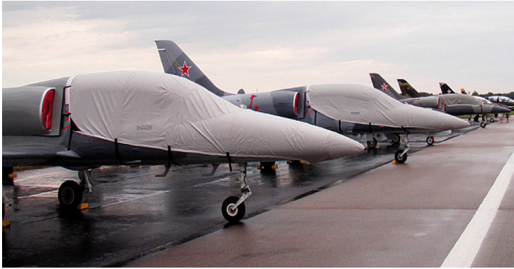
L-39 Canopy/Nose Covers & Plugs

Covers developed this material combination especially for aircraft protection. The outer material is medium weight and treated for water resistance, UV resistance and anti-static buildup. The inner lining is a very soft and smooth microfiber to prevent scratching. The material is very reflective, and tests show that the cabin interior temperature can be reduced to near-ambient temperature on the hottest of days. It is water, ice and snow repellent, yet breathable to allow moisture to escape from between the cover and the aircraft surface.