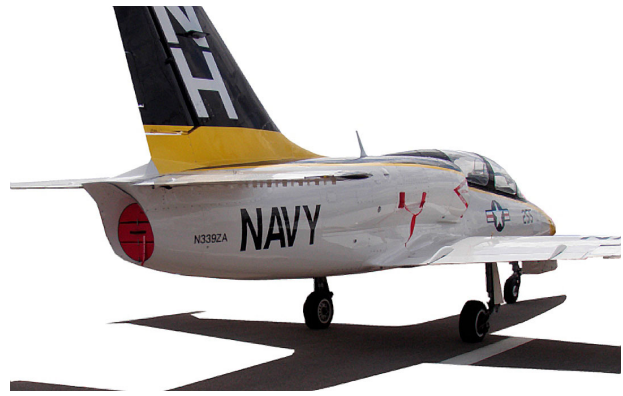
L-39 Exhaust Plug