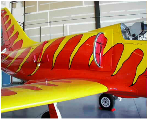
Inlet Plug, folding type