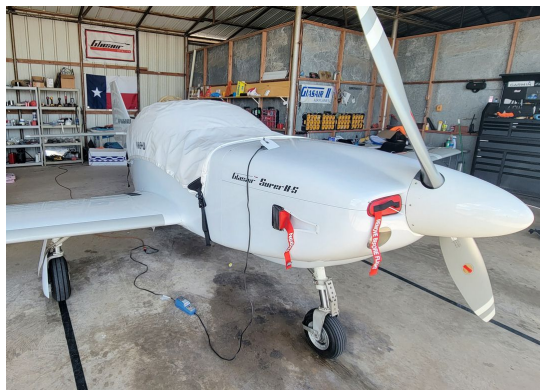
GLASAIR S2-RG Canopy Cover, Engine Plugs