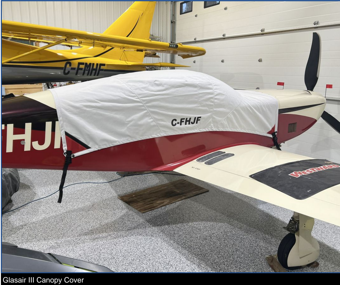
Glasair III Canopy Cover