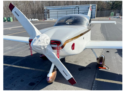
Glasair II 2-Blade Prop Cover