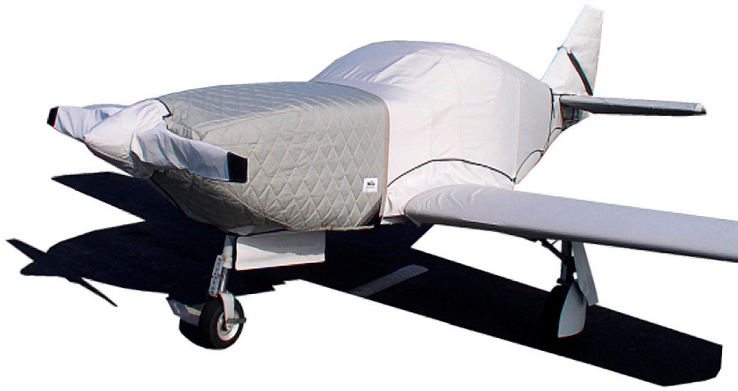
Glasair I Insulated Engine Cover, Prop Cover, Etc.