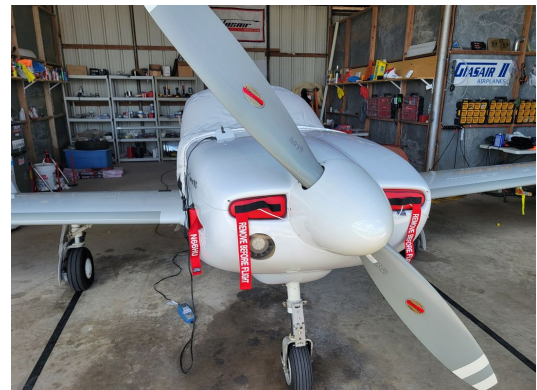
GLASAIR S2-RG Canopy Cover, Engine Plugs