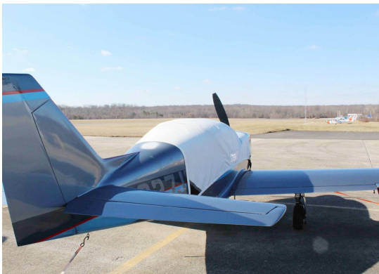
Glasair II Canopy Cover

This cover type is made from Silver Acrylic Sunbrella canvas and is 100% lined with a soft and smooth microfiber. Bruce's Custom Covers developed this material combination especially for aircraft protection. The outer material is medium weight and treated for water resistance, UV resistance and anti-static buildup. The inner lining is a very soft and smooth microfiber to prevent scratching. The material is very reflective, and tests show that the cabin interior temperature can be reduced to near-ambient temperature on the hottest of days. It is water, ice and snow repellent, yet breathable to allow moisture to escape from between the cover and the aircraft surface.